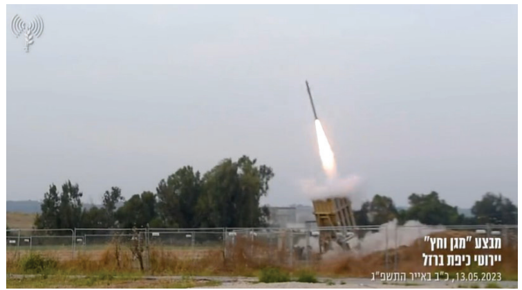
IDF spokesperson released documentation of Iron Dome in action, intercepting PIJ rockets