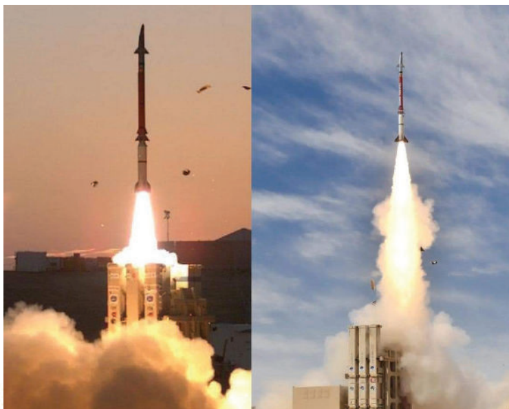
IDF spokesperson released documentation of Iron Dome in action, intercepting PIJ rockets

Several key conclusions can be drawn from this 5-day operation: