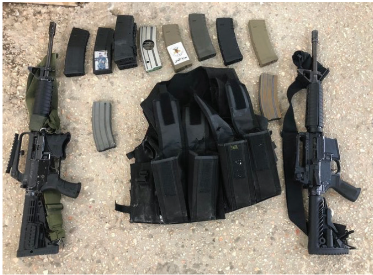
Firearms found during the IDF and other special units' arrests in Tulkarm