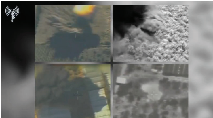
IDF spokesperson released drone documentation of PIJ terror targets attacked in Gaza