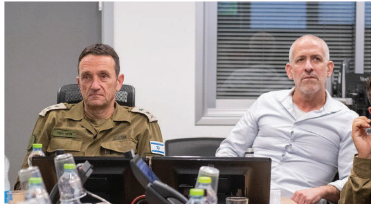
IDF Chief of General Staff Lt. Gen. Herzl Halevi and Head of Shin Bet Ronen Bar in an operational assessment during the Shield and Arrow Operation