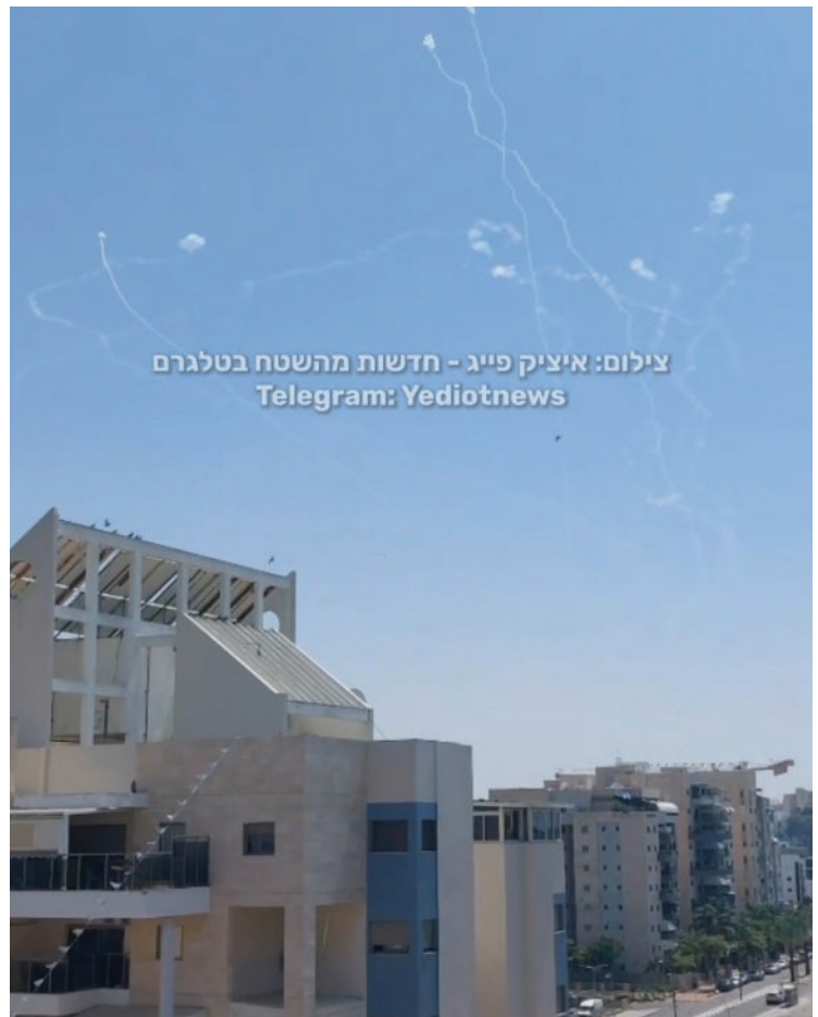
Rocket interceptions above southern Israel

Israel should adopt the Syrian model in Gaza and pursue an open-ended campaign. This implies keeping on "mowing the lawn" there by striking PIJ and Hamas-related targets, including senior militants, rocket warehouses and other terror-related targets. This could lead to escalation, but would make Israel better positioned in terms of eroding the enemy's force buildup and prevent large-scale capacities from amassing inside Gaza toward H-Hour.