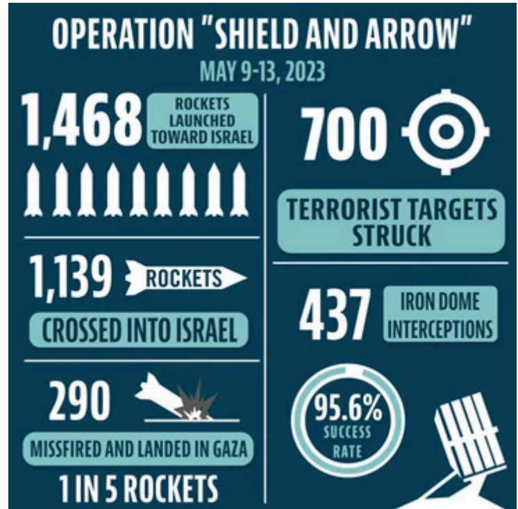
IDF Spokesperson's summary of the operation in Gaza