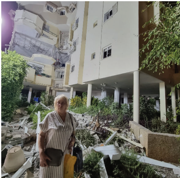
Israeli citizen, resident of a Rehovot building that suffered a direct hit by a PIJ rocket standing amid the rubbles. The hit caused the death of an 80-year-old woman