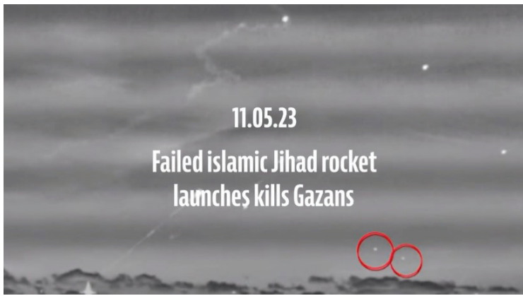
IDF spokesperson released documentation of mislaunched PIJ rockets landing inside Gaza, harming innocent Gazan civilians