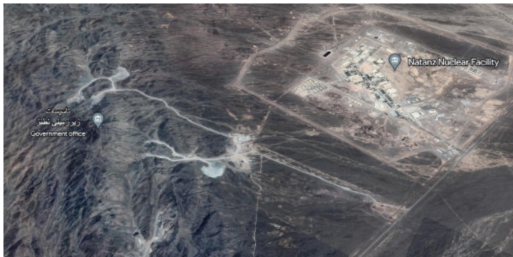
New satellite evidence suggests the excavation of a new underground nuclear facility near the existing Natanz nuclear site

Israel's concerns mount as Iran keeps accumulating highly enriched uranium that may enable it to produce weapon-grade uranium for 5-7 nuclear explosive devices within 3 months, and tests long-range ballistic missile while the international community continues its appeasement of the Iranian regime and attempts to reach a dangerous deal