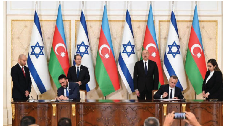
Israeli President Isaac (“Bougie”) Herzog made an official state visit to Baku, Azerbaijan, meeting his counterpart Azeri President Ilham Aliyev. The Iranian topic was reportedly front and center during the visit