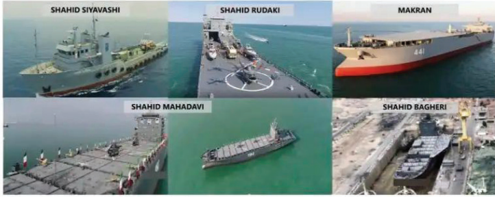
בוצעה הפלגה ארוכת טווח ראשונה של הבסיס הצף של חה"י של משה"מ SHAHID MAHADAVI