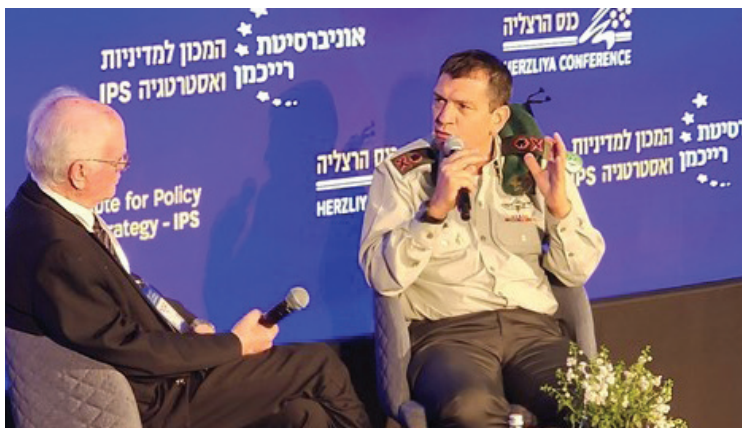
Israeli Head of Intelligence Corps, Maj. Gen. Ahron Haliva, making statements on Hezbollah during the Reichmann University conference