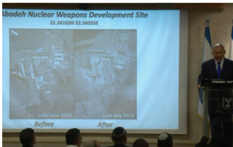
Israeli Prime Minister exposing the undeclared Marivan nuclear site in Abadeh district, Fars province in September 2019

Newly published satellite pictures analyzed by the AP allegedly show a new underground facility under construction in the nuclear site of Natanz, Iran. This facility suffered major damage in the July 2020 explosion, which Israel was accused of initiating (no official responsibility was claimed). The analysis estimated how the new facility, unlike the existing ground-level one, is buried at least 80-100 meters underground and below a mountain, to better protect it from air strikes.