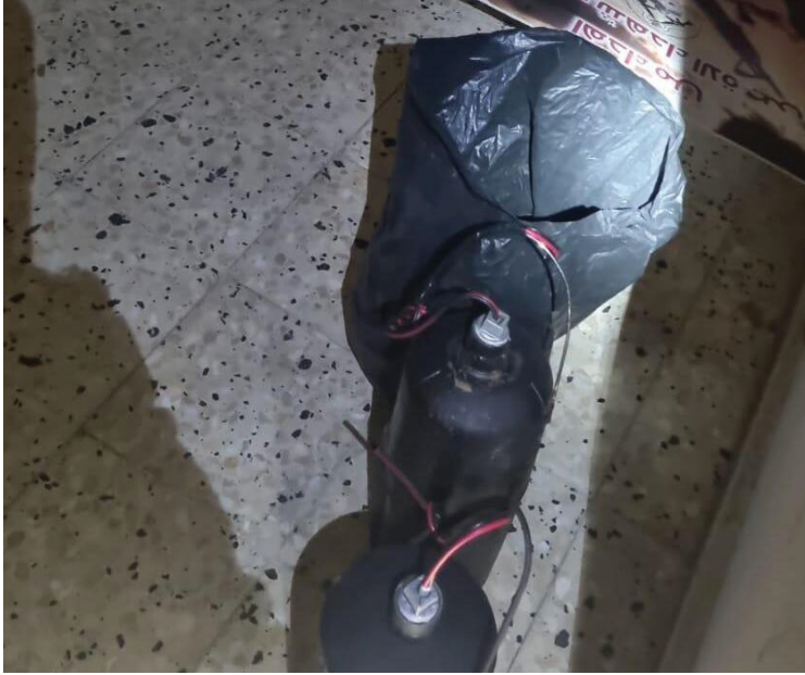
Deadly armament stored by Palestinian militants and caught the by IDF during a counterterrorism raid in the Balata refugee camp | May 21