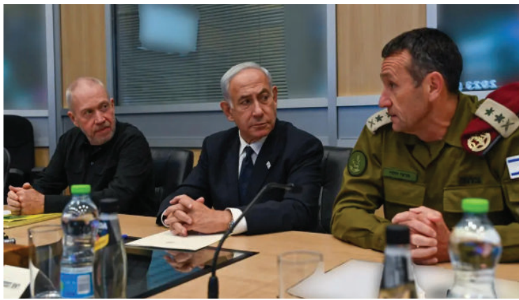
Top Israeli officials during the “Decisive Blow” military drill (Right to Left) Chief of General Staff Maj. Gen. Herzi Halevi, Prime Minister Benjamin Netanyahu, Minister of Defense Yoav Gallant