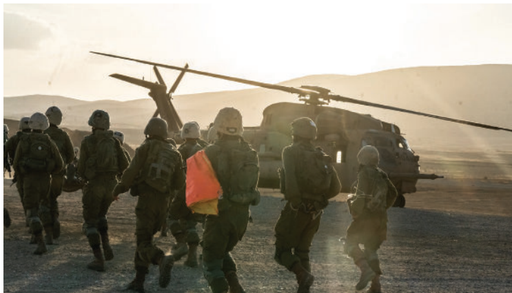
Israeli soldiers during a military drill