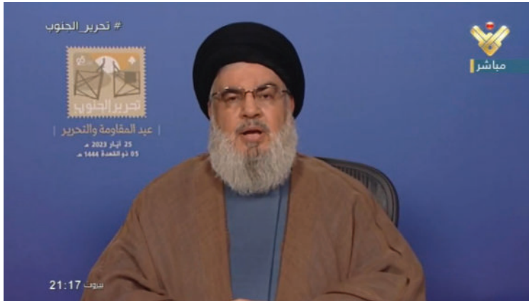
Hezbollah Secretary General Hassan Nasrallah responds to statements made by senior Israeli officials on Hezbollah's official TV, Al-Manar