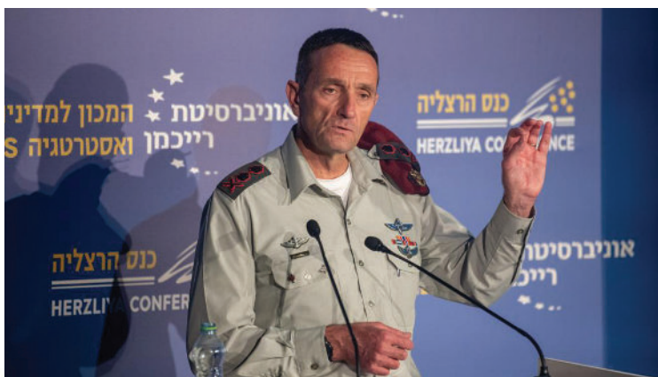
Israeli Chief of General Staff, Lieut. Gen. Herzi Halevi, making statements on Iran, Hezbollah, Palestinians and the region during the Reichmann University conference