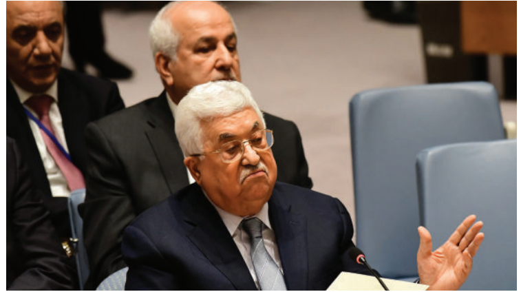
Chairman of Palestinian Authority, Mahmoud Abbas