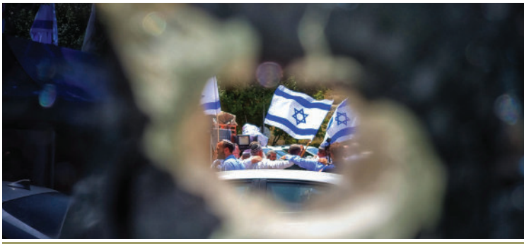
Israelis congregate to display unity and support in the Eli gas station the following day of the attack through the one of the bullet holes left in the Hummus Eliyahu window