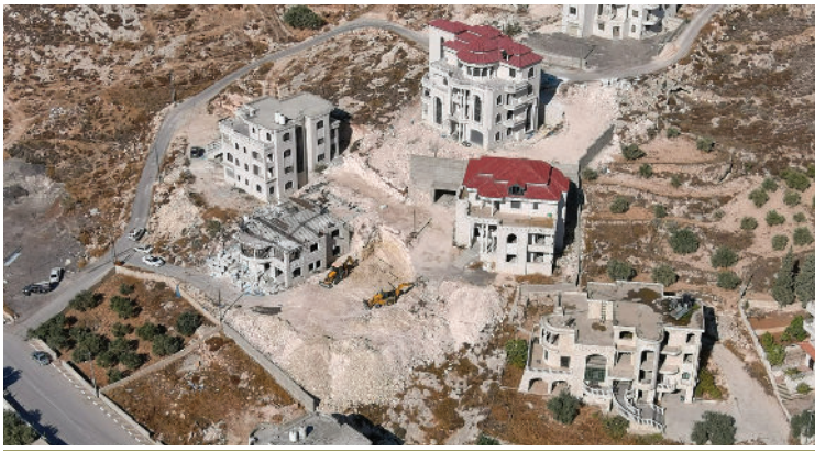
Illegal Palestinian structures in Area C, partially funded by the European Union