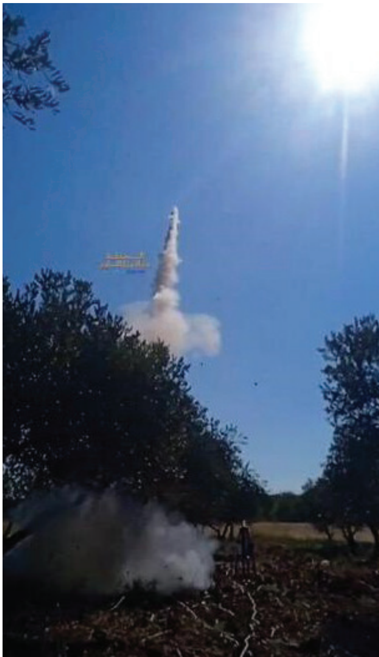
Documentation distributed by Hamas of the failed rocket launching from Jenin toward Israeli cities