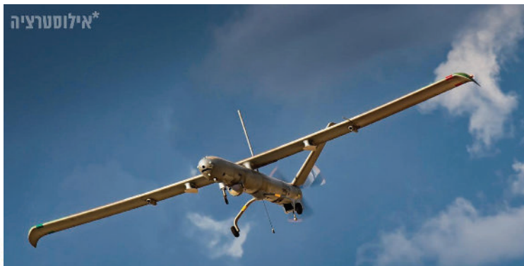
IDF spokesperson released an illustration of the attack UAV that took down a squad of three Palestinian terrorists, affiliated with Hamas and PIJ, after committing a series of shooting attacks