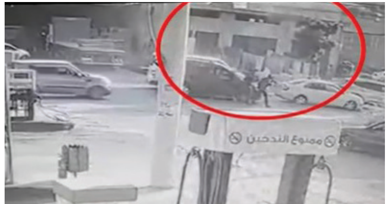
The moment of neutralizing the second terrorist who was on the run in the village of Tubas, as captured by the CCTV camera