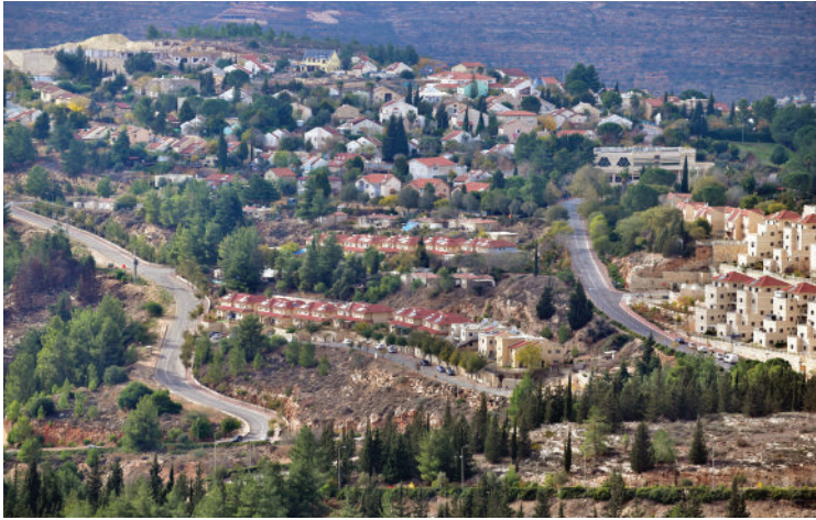
The Israeli government approved another 1,000 housing units near the site of the Eli terror attack, bringing the total number of approved units in Judea and Samaria to a record 13,000 within one semester alone (The Jewish community of Eli)