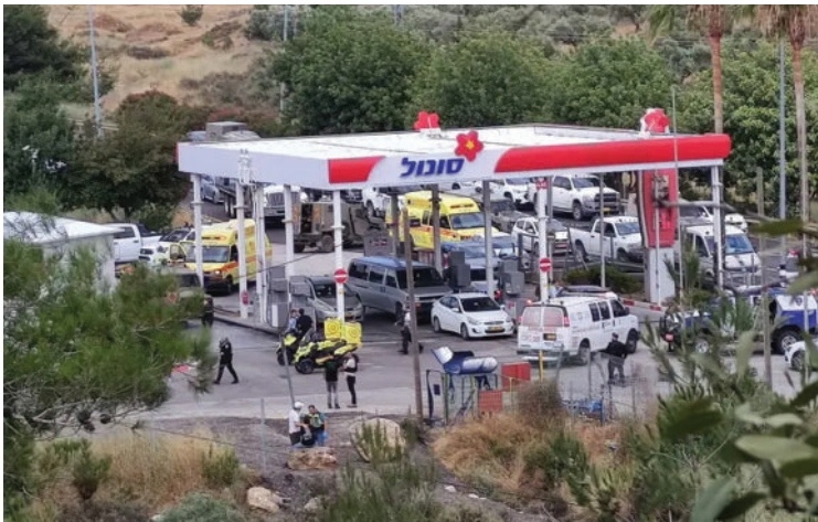
The scene of the terror attack in the gas station near Eli