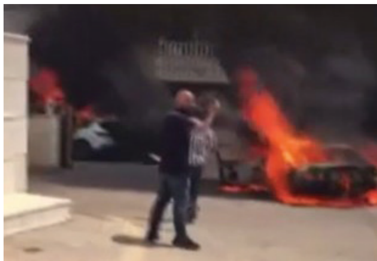
Torched vehicles and apartments in the Palestinian village of Turmus Aiya by groups of Jewish rioters as revenge for the Eli terrorist attack