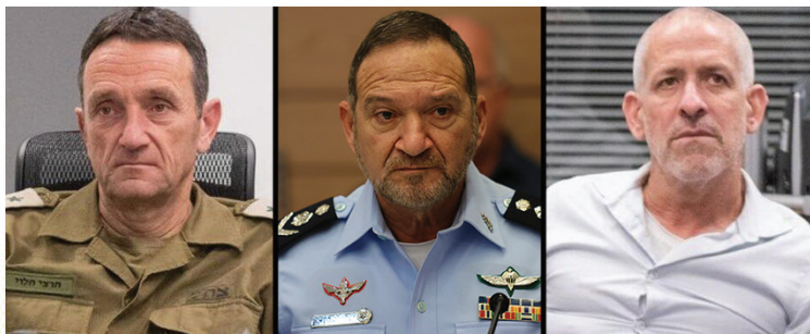
IDF Chief of General Staff Lieut. Gen. Herzi Halevi, Commissioner of the Police Yaakov Shabtai and Head of Shin Bet Ronen Bar published an irregular joint letter condemning violence on part of Jewish groups in Palestinian cities

○ The European Union has “equally” condemned both cases, dubbing the area “Israel/Palestine” albeit the lack of recognition of Palestine on the part of most EU member states. The US ambassador to Israel stated his deep concern about “the civilian deaths and injuries that have occurred in the West Bank these past 48 hours”. The embassy of Bahrain chose to strongly condemn “settler violence” while ignoring the Eli murder altogether.