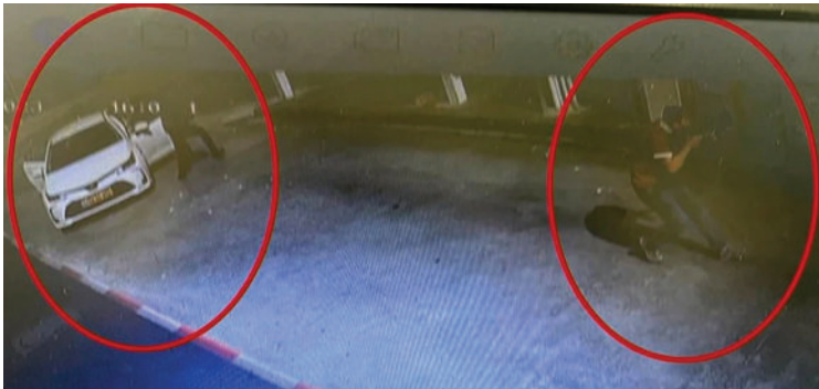
The two Palestinian terrorists as captured in the Eli gas station's CCTV cameras