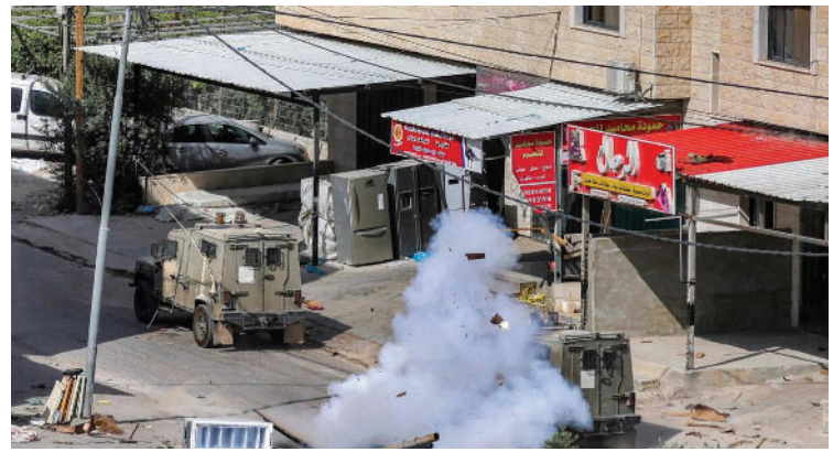
IDF forces operating in Jenin under heavy fire on June 19