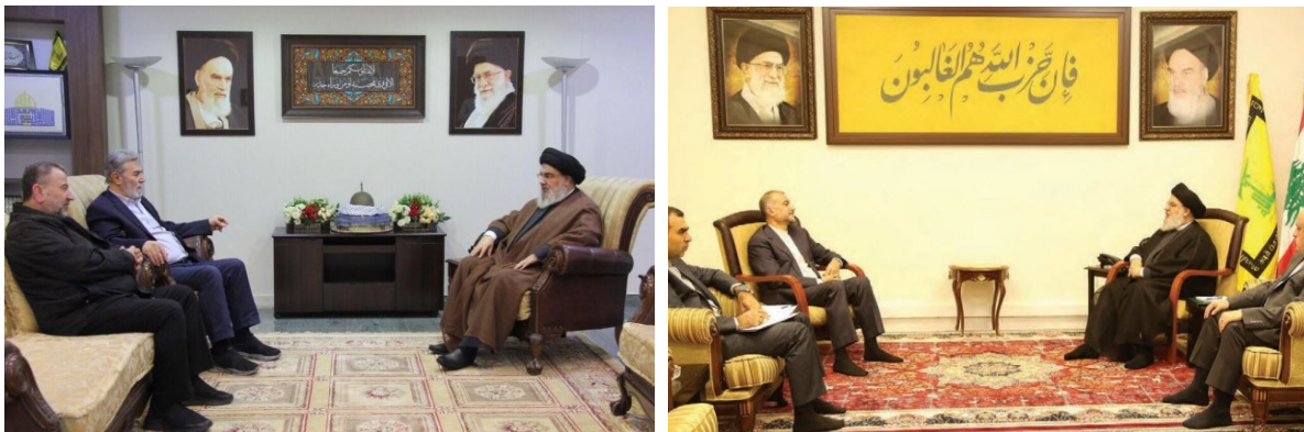
Hezbollah Secretary General meets Iranian Foreign Minister Abdullahian (right) and Hamas number two Saleh Al-Aruri and PIJ Secretary General Ziad Nahale (left) in his Beirut bunker

For Iran , the dilemma on whether or not to force Hezbollah into intervention is critical. If Iran loses Hezbollah, it loses a significant shield that to a large degree deters Israel from attacking Iran itself and its nuclear facilities. Israel knows that in case of an attack on Iran, Hezbollah will undoubtedly join the war and inflict a heavy toll on the Israeli home front. A scenario of thousands of rockets and precision missiles per day rained down on Israeli cities and strategic infrastructure is a heavy price that Israel is well aware of. On the other hand, Iran also knows that the Israeli understanding that Hezbollah cannot be allowed to remain belligerent will behoove Iran to instigate a surprise attack itself, before Israel gets ahead of it, to start a war under favorable conditions.