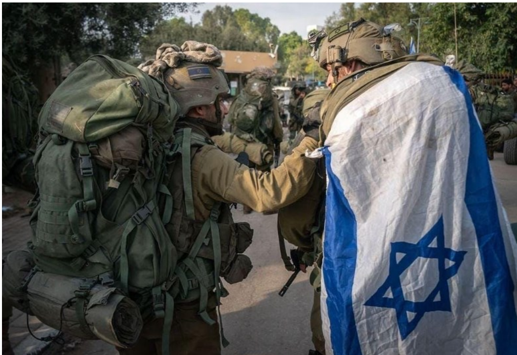
Paratroopers Brigade soldiers regain command of Kibbutz Be'eri after Hamas terrorists slaughtered hundreds of civilians

Alongside this effort, unprecedentedly quick efforts to establish Rapid Response Squads in Israeli towns, localities, and cities, led to more than 500 new such squads to be established and to expand existing ones, to protect communities from the potential of such riots taking place.