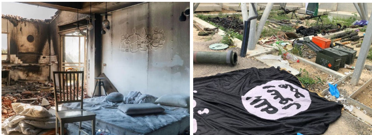
Remains of a family home in southern Israel (left). ISIS flag found in the Hamas terrorist's belongings among scores of ammunition

State of War: At the first declared state of war in Israel since the 1973 Yom Kippur War, prominent voices in the Israeli political and defense establishment refer to this moment as an existential struggle , that will determine Israel's stance in the region for generations to come. Israeli Prime Minister Benjamin Netanyahu stated that "we are going to change the face of the Middle East", possibly hinting at the wider, more strategic objectives of this war.