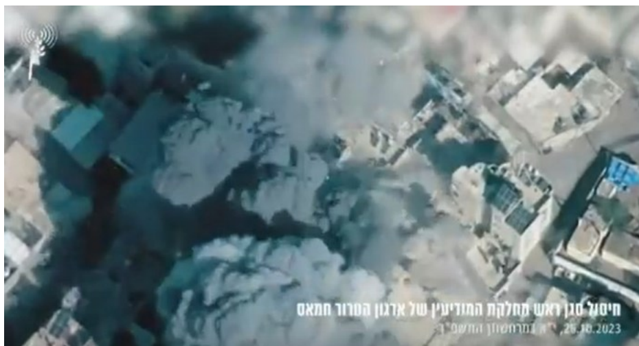
IDF documentation of the air strike that eliminated Hamas’ Head of Intelligence

Hiding behind civilians, placing its military infrastructure in densely-populated civilian areas and using civilians as human shields has been a long-standing tactic by Hamas to both attempt to avoid Israeli airstrikes while garnering international support and pressure on Israel to cease its strikes. Significant evidence over the years demonstrated Hamas’ abuse of UNRWA facilities, schools, hospitals, and other civilian sites for terrorist purposes. Meanwhile, the Gazan population is suffering intimidation, as confirmed by the IDF and multiple credible sources, by Hamas not to evacuate their homes. There is footage that even showed a car convoy of Gazan civilians being bombarded by Hamas in order to prevent them from evacuating. Other reports indicated Hamas constructs roadblocks to prevent their evacuation. “We are telling the people of northern Gaza, stay in your homes,” said Iad Al-Buzum, spokesperson for the Hamas Interior Ministry. “The occupier wants to uproot us from our country. We shall die before we leave.” The Gaza governmental media ministry ordered residents to “ignore” the evacuation warnings.