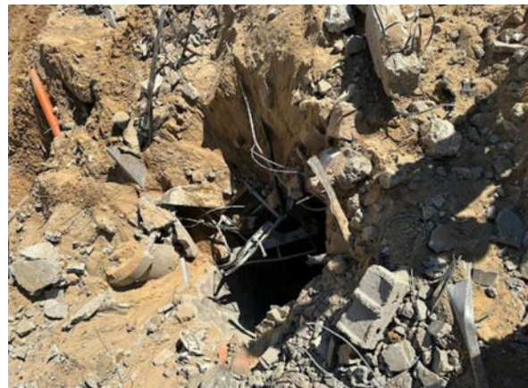
Operational tunnel shaft in Al Shifa (IDF Spokesperson)

To enable the safe evacuation of civilians from what has become a battle zone, the IDF allowed and even facilitated the movement of civilians while Hamas was shooting at the Israeli troops 5 . It has also refrained from ordering civilians to leave, but rather enables them to leave – as reiterated by the IDF Spokesperson and illustrated in a phone call between an IDF officer and the hospital director. The IDF is also providing extensive evidence of the use of the Hospital as a terrorist hotspot- exposing terror tunnels 6 , taking kidnapped Israeli civilians through the hospital 7 etc.