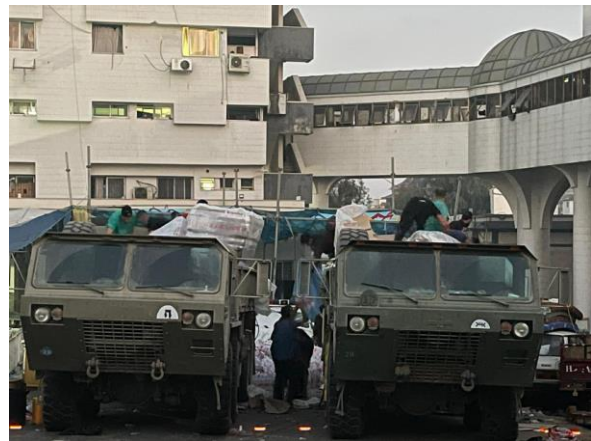
IDF transfer of food and water to Al Shifa

This is unprecedented on a global scale: a country that provides supplies to the civilians of an enemy entity.