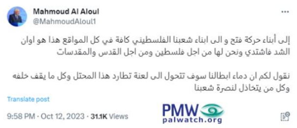
Senior PA official Mahmoud Al Aloul praising the October 7 massacre and calling for revenge against Israel