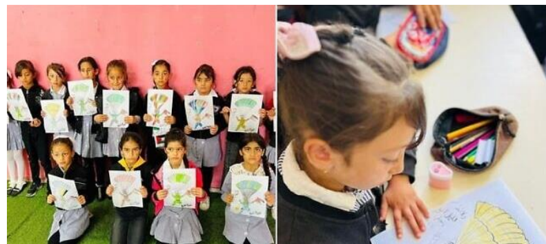
Palestinian children incited to anti-Semitism and Jihad