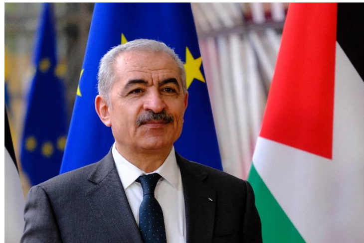
Palestinian Prime Minister Mohammed Shtayyeh refused to condemn the October 7 massacre, and proposed a unity government with Hamas