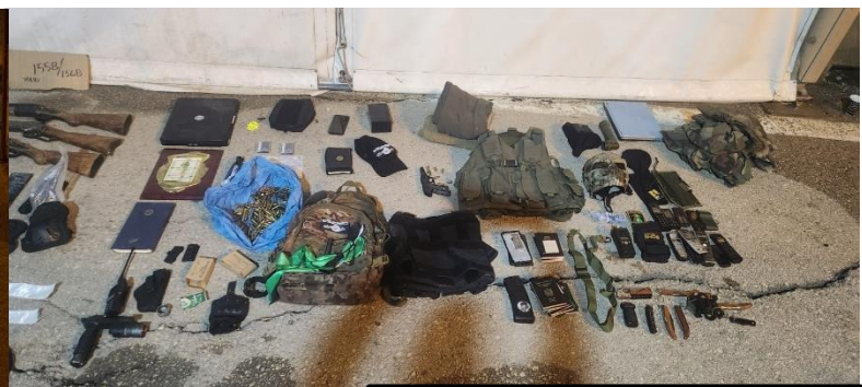
The above photos: IDF counterterrorism operations in Palestinian towns around Judea and Samaria successfully thwart deadly terrorist attacks against Israelis