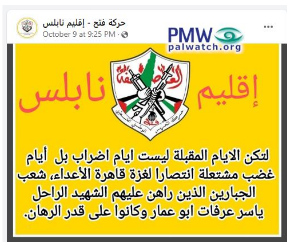
Official Fatah’s Nablus Branch praising the October 7 massacre on social media and calling for riots around the territories