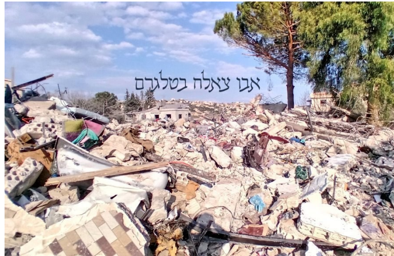
The damage in Bint Jebil, Credit: Abu Saleh, Telegram ( https://t.me/abusalehg1 )