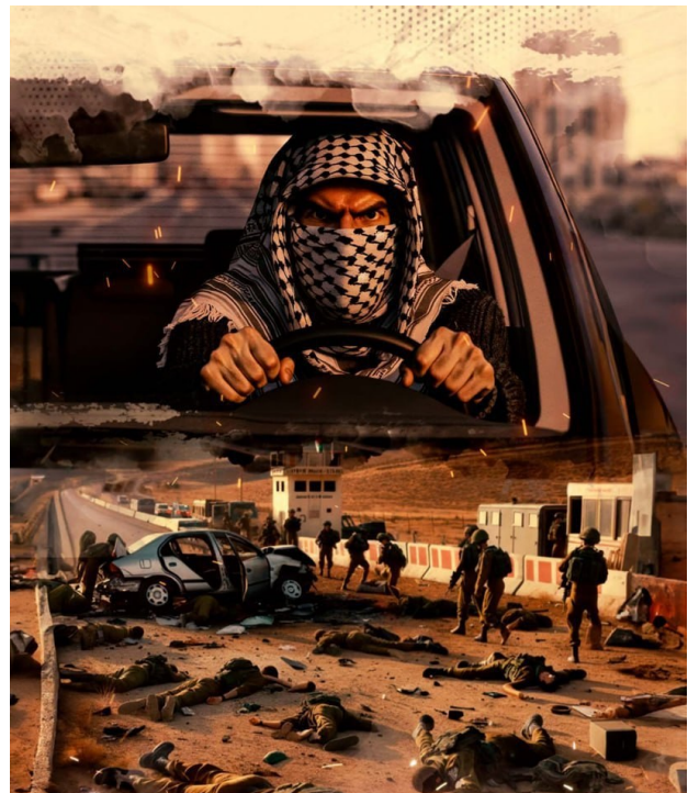
@mutared4 on X