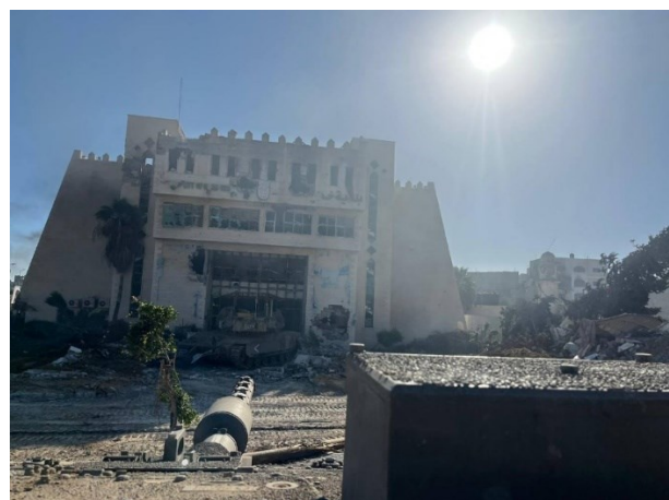
82 nd Battalion of 7 th Armored Brigade captures the Municipal building in Kahn Younis, Credit: IDF Spokesperson