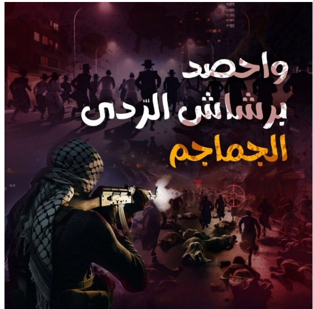
“Collect skulls with the rifle” | @mutared4 on X