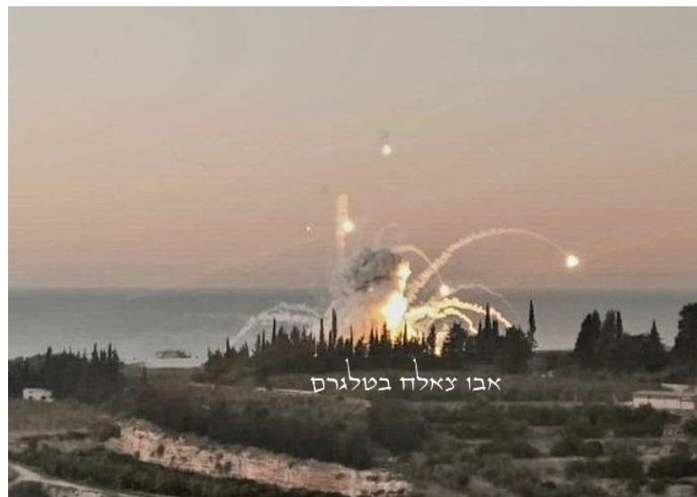
The damage in unspecified location in Lebanon