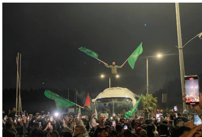
Palestinian prisoners celebrate their release, November 24, 2024

The above illustrates the heavy price exerted on the Israeli public, and is reflective of the dilemma of the Israeli leadership before the release of Palestinian prisoners, in light of their danger to society, as part of a broader set of considerations as part of hostage swap deals. That includes public pressure, the value of life, and the commitment to bring hostages home alongside serious security elements.