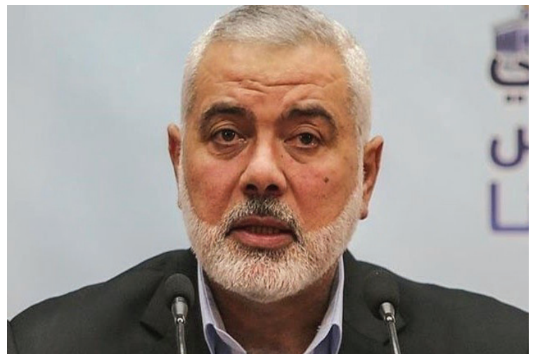
Ismail Haniyyeh, the chief of Hamas's political bureau