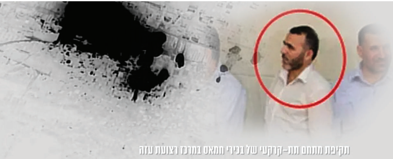
מקיפות מתחם מות-קרקעי של בכירי חמאס במרכז רצועת עזה

Hamas' number 3 in Gaza, Marwan Issa, was assassinated in an IDF airstrike on a tunnel around the Nusseirat area in Gaza, a move dubbed "especially significant" by Israel | Airstrike footage: IDF Spokesperson