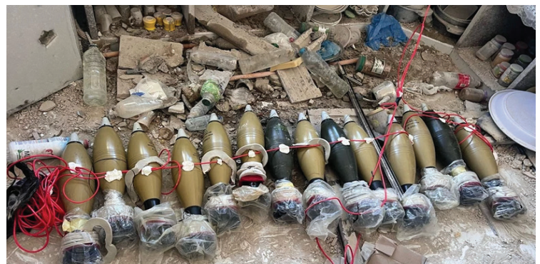
As part of the Israeli combatants' attack on terrorist infrastructure in the east of 'Hamed' neighborhood, the forces located in a hiding apartment of Hamas operatives: shells, explosives, boxes of ammunition, Kalashnikov rifles and mortar bombs

Biden still hopes to reach a temporary ceasefire during Ramadan, which would later become permanent. On March 12th, the Qatari Foreign Minister said the sides are still far from reaching a deal. The US administration has adopted a similar line to Haniyeh, which blames Israel's "extremist" government as the main hurdle to reaching a deal. Over the week, Netanyahu and other Biden administration officials exchanged messages through their speeches that opposed each other. Netanyahu said in a speech to AIPAC that he is committed to destroying the Rafah brigades of Hamas, and preventing Israel from doing so would essentially mean preventing Israel from achieving total victory. Netanyahu also said that he does not carry out his own personal agenda but acts in accordance with the will of the majority in Israel. The same messages were repeated in Netanyahu's interview with Politico.