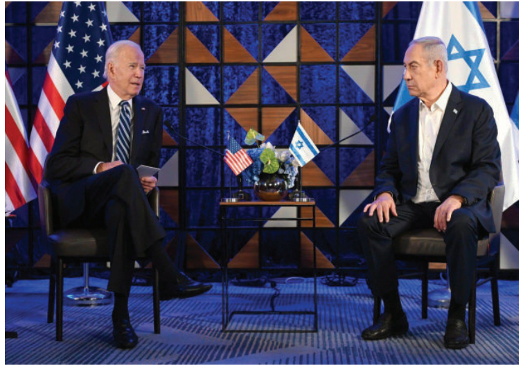
United States President Joe Biden during his visit to Israel with Israeli Prime Minister Benjamin Netanyahu, October 18, 2023