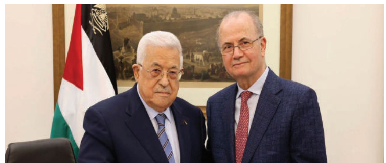
Mohammed Mustafa was appointed by Mahmoud Abbas as the new Prime Minister of the Palestinian Authority