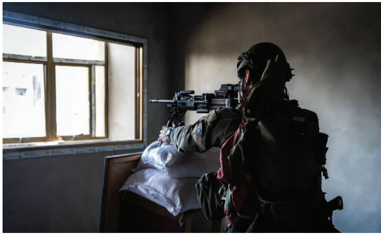
An IDF soldier in the Gaza Strip

During his visit to Israel, Blinken warned Netanyahu and the Israeli war cabinet in a meeting on Friday that Israel's security and its place in the world are in peril, as on the current trajectory, without a clear plan for the day after the war, Israel would be left with a major insurgency it can't handle. "You need a coherent plan, or you're going to be stuck in Gaza," Blinken said. The Secretary of State said that on the current path, Hamas will stay in control in Gaza or there will be anarchy, which will just create the conditions for more terrorism.