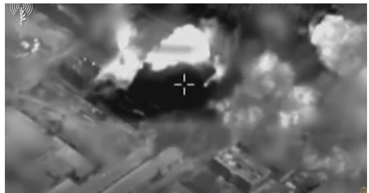
Attack of Hezbollah infrastructure in southern Lebanon