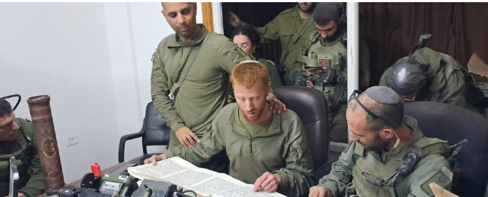
Happy Purim | IDF soldiers read the traditional Esther Scroll of the holiday of Purim in the Al Shifa Hospital in Gaza