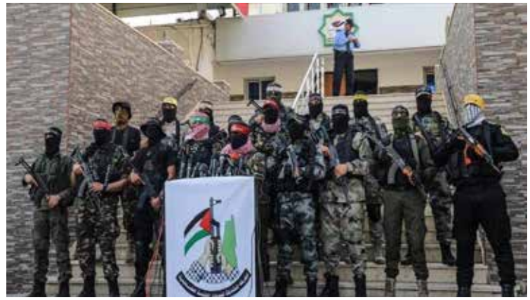
Palestinian terrorist factions call for participation in the "#Global_Ramadan_Flood" campaign in "support of Gaza"

Biden has framed his approach that he wants to help Israel take care of itself and that he is a friend of Israel and therefore Israel should listen to him regarding the Two-State Solution. "As a lifelong supporter of Israel, my entire career, no one has a stronger record on this than I do...There is no other path that guarantees Israel's security and democracy."