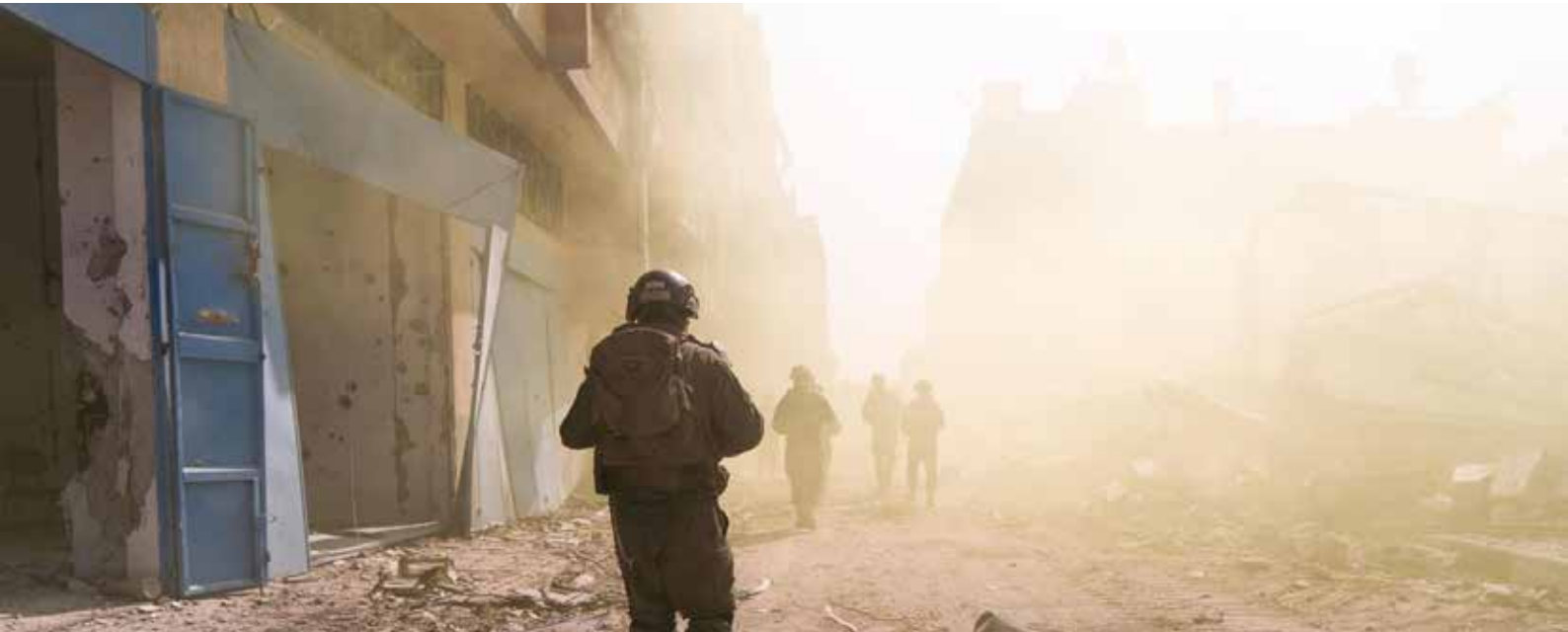
The forces of the 98th Division continue to surround the "Hamed" neighborhood and raid terrorist infrastructure in the area