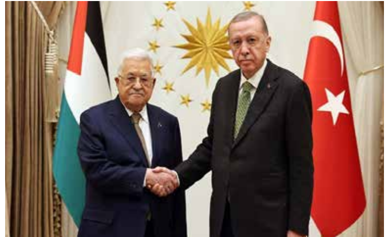
Abu Mazen, Chairman of the Palestinian Authority, met in Ankara with Recep Tayyip Erdogan, President of Turkey