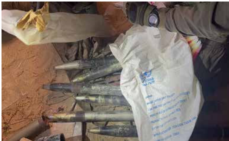
The IDF forces located a weapons warehouse near a school that serves as a shelter for the citizens of the Gaza Strip. The fighters located another munitions warehouse in the heart of a civilian neighborhood, dozens of warheads for rockets, cartridges and ammunition were seized in the warehouse, some of the munitions were disposed of in UNRA sacks