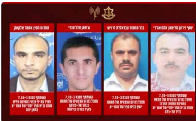
Terrorists of the military wing of Hamas and Islamic Jihad in Palestine are employed as UNRA employees