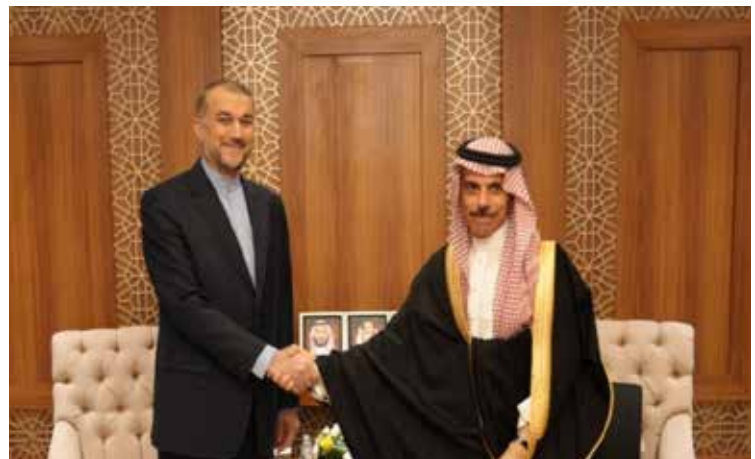
Hossein Amir Abdollahian, the Iranian Foreign Minister, met in Jeddah with the Saudi Foreign Minister, Faysal bin Farhan