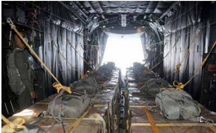
The additional airdrops of humanitarian aid by US Central Command to Gaza

The mediation with Lebanon has failed; Hochstein and his representative in Beirut have left the Middle East and announced the suspension of all talks related to a ceasefire. Hezbollah is preparing for war; they are aware of the discourse in Israel, aware of the IDF's preparations, and all that remains is for each side to calculate when the right time is to engage in conflict.