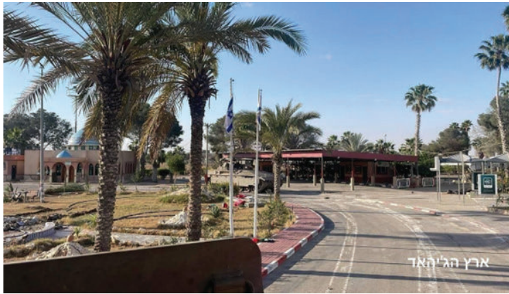
Israeli tank at the Rafah crossing

According to an Egyptian source, there are Israeli plans to address each area in Rafah separately to avoid direct confrontation with the USA and the international community.