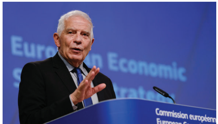
Josep Borrell, EU's Head of the External Action Service and VP of the Commission, announced the expected recognition of the "State of Palestine"

by several EU members | Photo: Alexandros Michailidis, Shutterstock.com