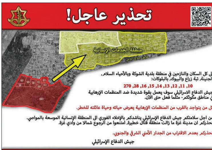
IDF leaflets scattered over Rafah advising civilians to evacuate to safe zones

As part of the revised deal, Hamas had agreed to release 3 hostages every 3 days and subsequently, "dead or alive", and changed the demand for the release of hostages to occur on a weekly basis. The refusal to commit to release living hostages, and the vague text that suggests theoretically that living hostages could be shot to death before their release, was one of the elements that pulled the brakes on the deal. Hamas political bureau chief called upon Iran and Turkey to pressure Israel to accept a ceasefire deal and prevent it from proceeding with its operation in Rafah.