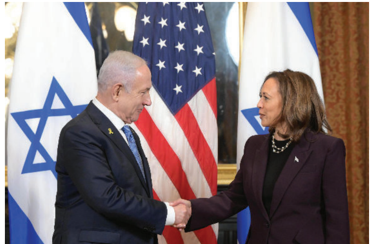
Vice President Harris meets Prime Minister Benjamin in the Vice President's ceremonial office at the Eisenhower Executive Office Building in Washington, DC, July 25, 2024.

Netanyahu tried to expedite the receipt of munitions from the US to continue the campaign in Gaza and in preparation for the inevitable escalation on the northern front. In his Washington speech, Netanyahu said: "Give us the tools faster, and we will finish the job faster." He was accompanied on his US trip by the Minister of Strategic Affairs, Ron Dermer, who met with the Chairman of the House Foreign Affairs Committee to discuss the approval of the transfer of certain munitions, but did not disclose which munitions.