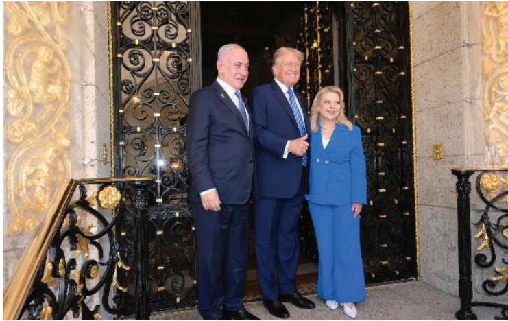
Former US president Donald Trump greets Prime Minister Benjamin Netanyahu and his wife Sara at his Mar-a-Lago resort, Florida, July 26, 2024.

Trump signaled that he wants to resume the peace process that perhaps would include the establishment of a Palestinian State. In an interview with Fox News on Thursday, he said about the war: "I will make sure it ends quickly, it has to end," and added: "It can't go on like this, it's too long, it's too much." He posted on "Truth Social" that he looks forward to meeting with the Israeli Prime Minister to move forward and achieve peace in the Middle East, attaching a letter he received from Mahmoud Abbas on July 14 (a day after the assassination attempt).