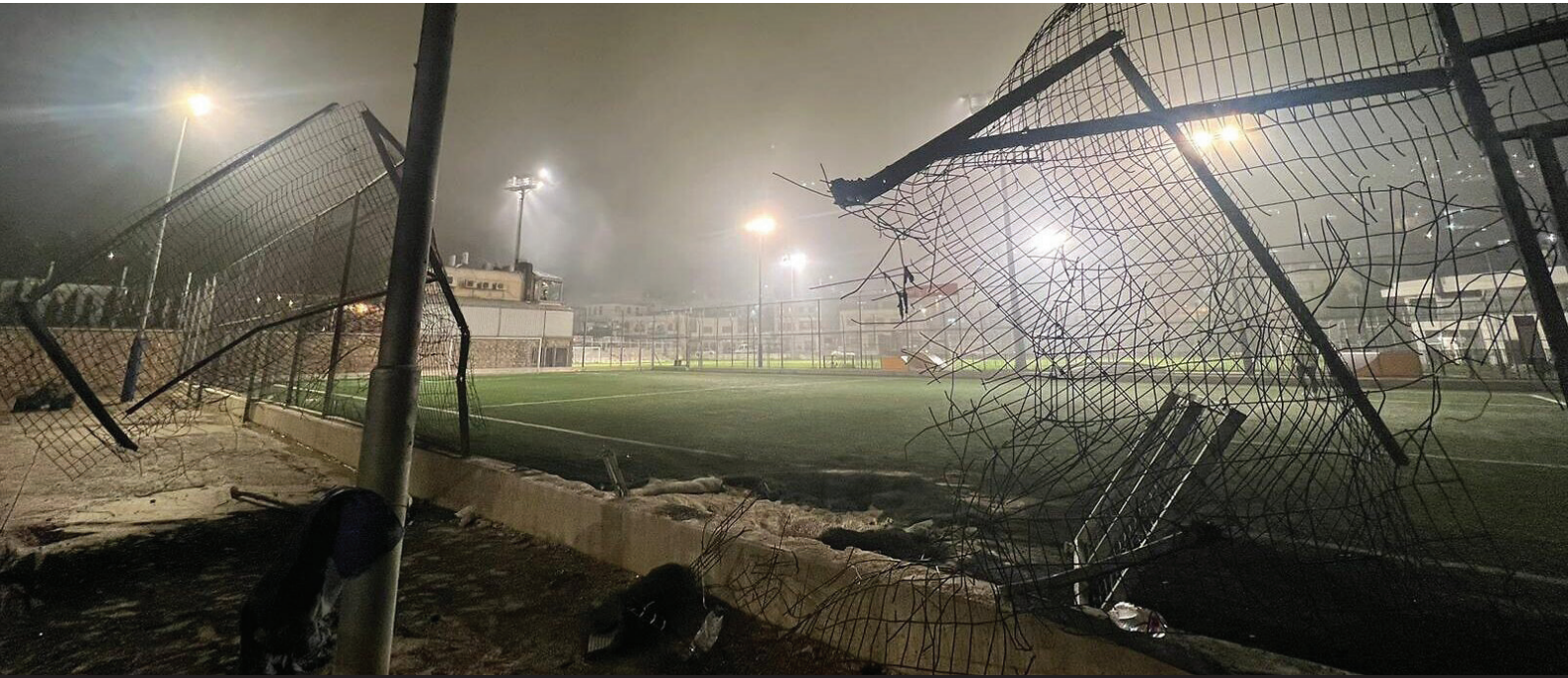
The aftermath of a deadly rocket attack by Hezbollah on a soccer field in Majdal Shams, July 27, 2024.