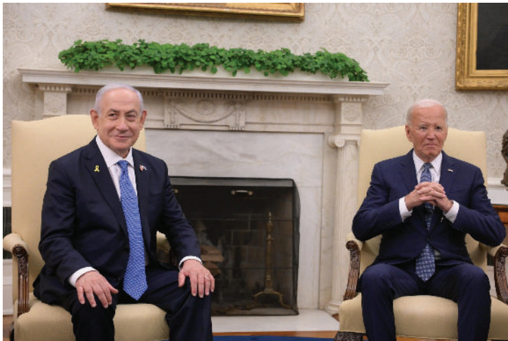
US president Joe Biden in the Oval Office with Prime Minister Benjamin Netanyahu, July 25, 2024.