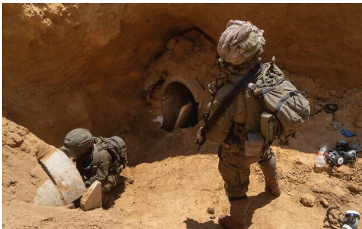
IDF troops are seen at the entrance to a tunnel in southern Gaza's Khan Younis where the bodies of five Israeli hostages were held, July 24, 2024.