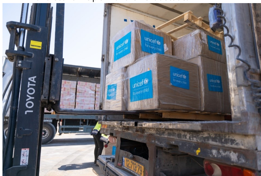
Polio vaccines intended for Gaza are loaded onto trucks at the Kerem Shalom Crossing, August 25, 2024