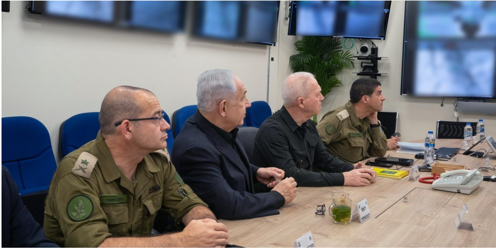
Prime Minister Benjamin Netanyahu, Defense Minister Yoav Gallant and others at the Kirya military headquarters in Tel Aviv, early on August 25, 2024.