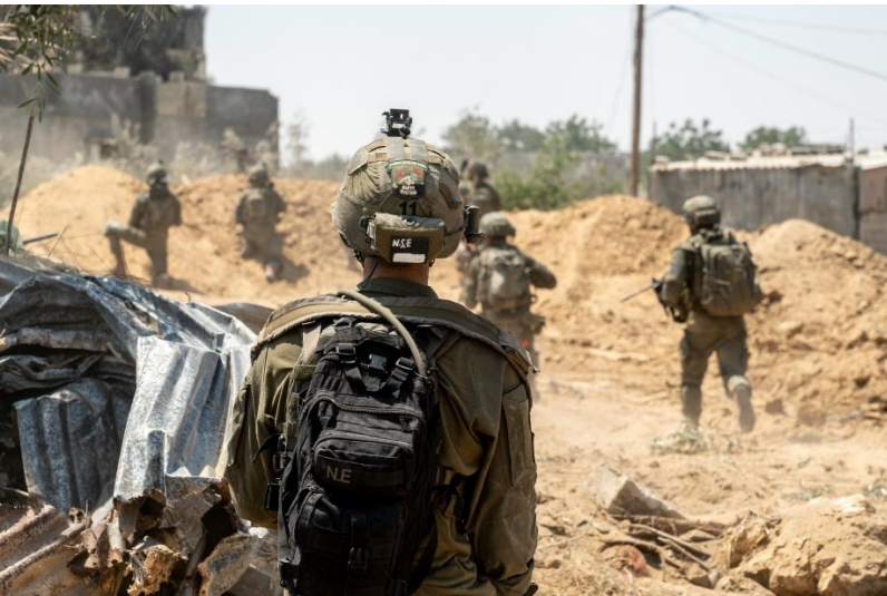
Troops of the 7th Armored Brigade operate on the outskirts of Deir al-Balah in the central Gaza Strip, in a handout image published August 24, 2024

with Islamic Jihad Secretary-General Ziad Nakhleh and his deputy, Mohammed al-Hindi .