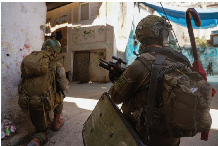
IDF troops operating in the "Summer Camps" Operation