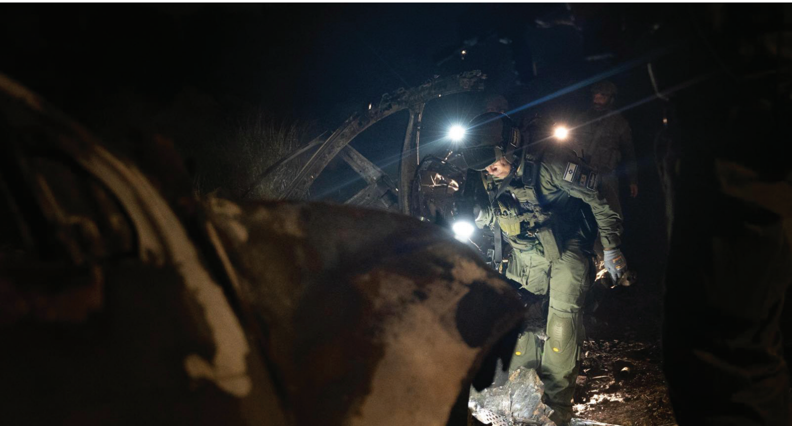
IDF troops examine the wreckage of a car bomb in the West Bank settlement of Karmeit Zzur, early August 31, 2024.