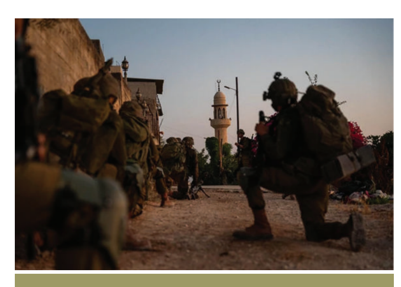
IDF troops operating Judea and Samaria as part of Operation: Summer Camps

attack on Israel. The U.S. Department of Justice indicted him as an ISIS supporter who "planned to kill as many Jews and Israelis as possible."