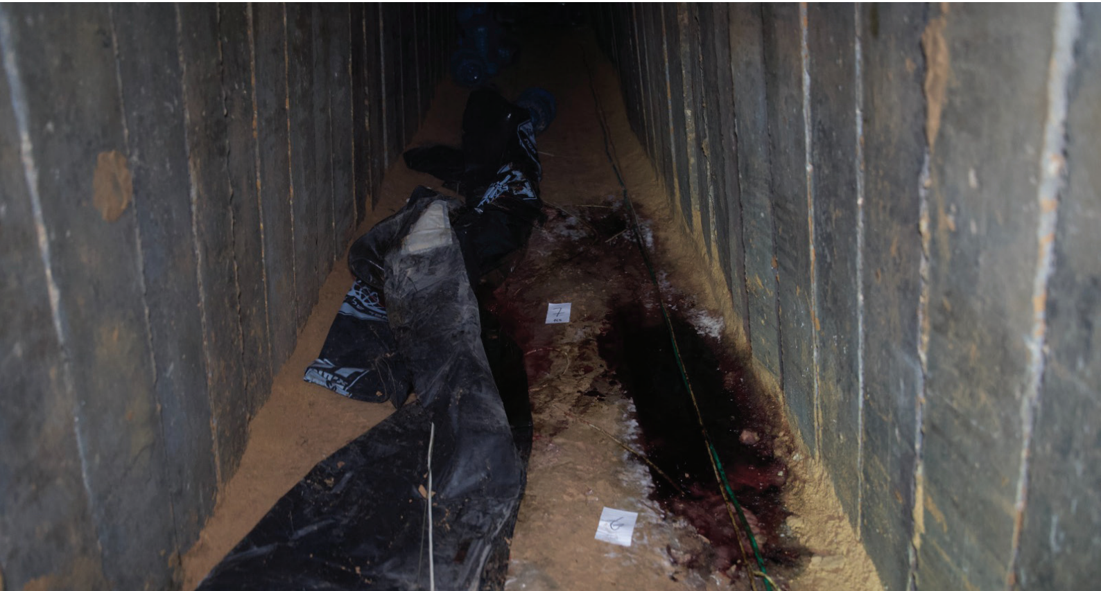
This image released by the IDF on September 10, 2024, shows bloodstains inside of a tunnel in southern Gaza's Rafah where six Israeli hostages were executed by Hamas terrorists.