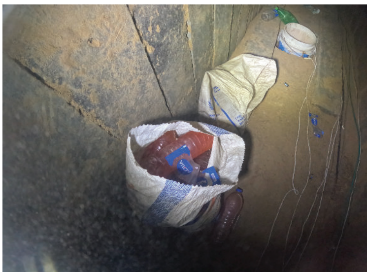
This image released by the IDF on September 10, 2024, shows bottles filled with urine and a makeshift toilet inside of a tunnel in southern Gaza's Rafah where six Israeli hostages were murdered by Hamas terrorists