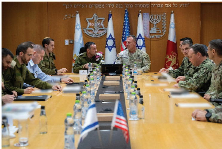
US CENTCOM chief Gen. Michael Kurilla (right) meets with IDF Chief of Staff Lt. Gen. Herzi Halevi (left) and other generals at the IDF HQ in Tel Aviv, September 8, 2024