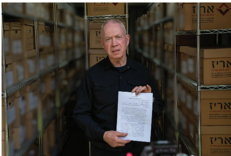
Defense Minister Yoav Gallant holds a document written by the former commander of Hamas's Khan Younis Brigade, Rafa'a Salameh, at an IDF intelligence base in central Israel, September 11, 2024.