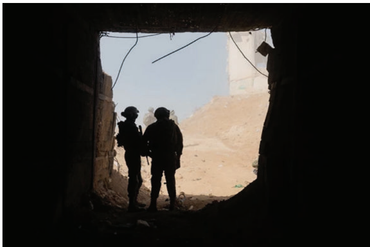
IDF troops operating in Gaza