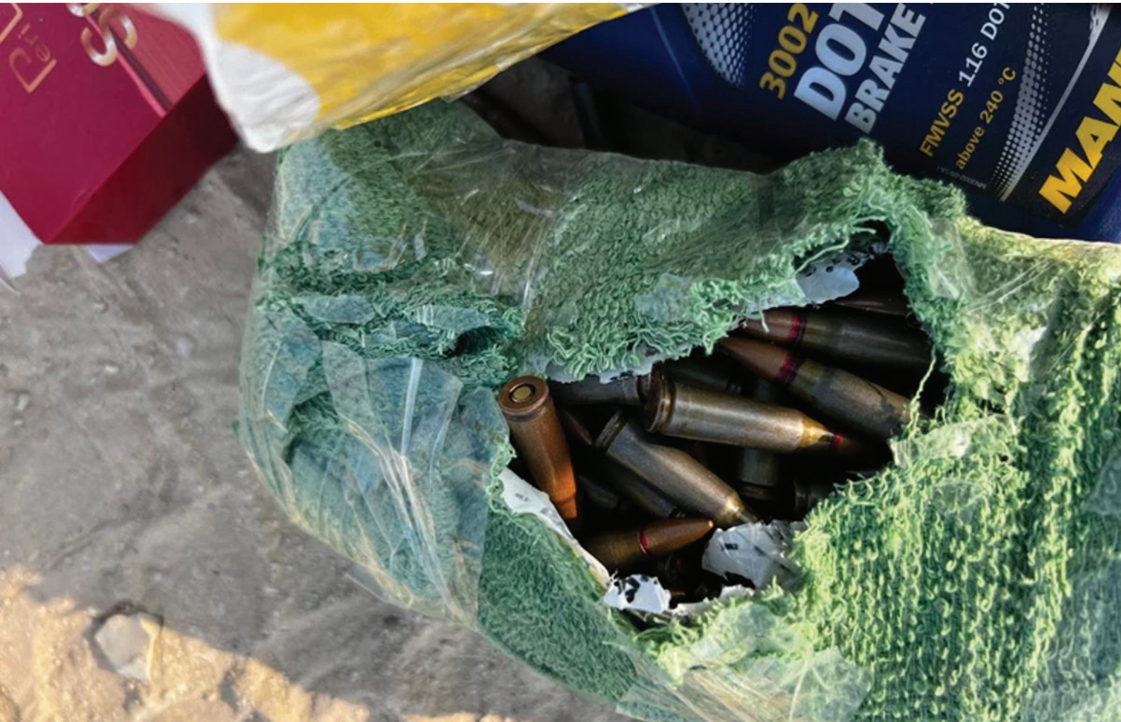
Smuggled weapons were discovered by the IDF at a checkpoint in a humanitarian convoy traveling from Northern Gaza to the South.