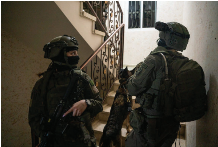
IDF raid in Samaria that captured terror operatives and confiscated weapons