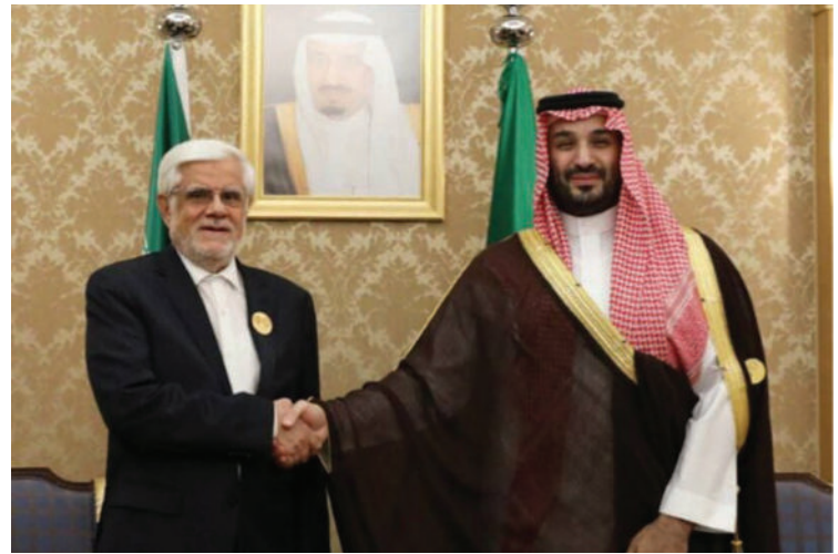
Iran's First Vice President, Mohammad Reza Aref, meeting with Saudi Crown Prince Mohammed Bin Salman at the summit of the Organization of Islamic Cooperation (OIC) and the Arab League held in Riyadh.]