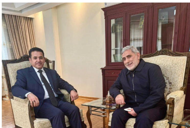
Iraqi National Security Advisor Qasim al-Araji lead a delegation to Tehran, where he met with Brigadier General Esmail Qaani, Commander of the IRGC Quds Force.