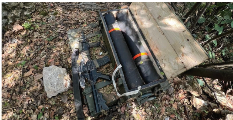
Weapon silos used by Hezbollah found by IDF troops of the Golani Brigade in Lebanon