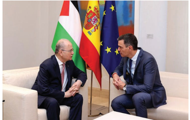
Spanish Prime Minister Pedro Sánchez and Palestinian Prime Minister Mohammad Mustafa meeting in the inaugural session of the Palestinian-Spanish Joint Ministerial Committee at the Moncloa Palace in Madrid.