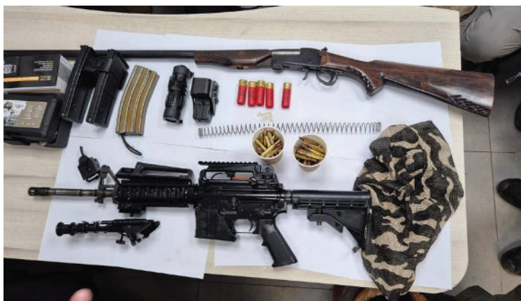
Weapons seized by IDF troops as part of counter-terrorism operation in Judea and Samaria