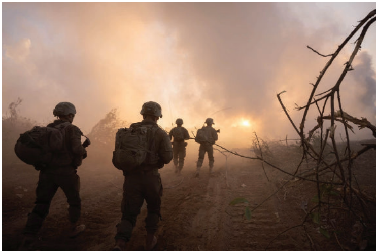
IDF troops operating in the Jabalia area