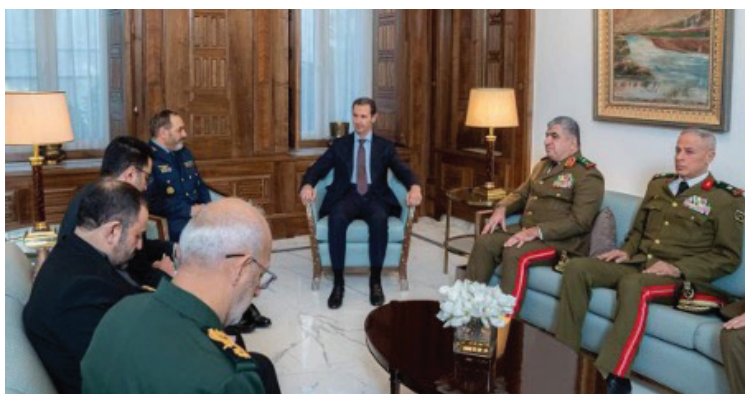
Iranian Defense Minister Brigadier General Aziz Nasirzadeh meeting with Syrian President Bashar al-Assad in Damascus