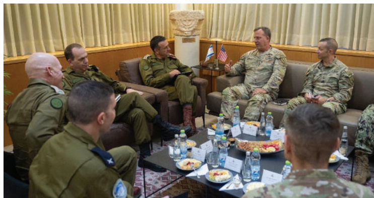
CENTCOM Commander General Michael "Erik" Kurilla, arrived in Israel as the official guest of the Chief of the General Staff LTG Herzi Halevi.