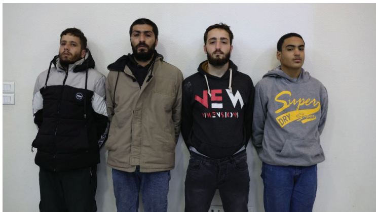
ISIS operatives arrested by Al Julani's security services. Allegedly the operatives were part of a cell that planned to carry out a terrorist attack in a Shia temple in Damascus

> U.S. House Speaker Mike Johnson announced upcoming legislation to sanction ICC officials over perceived bias against Israel and the U.S