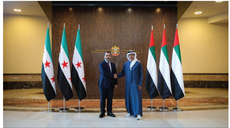
Syrian Foreign Minister Asaad Hassan al-Shibani, Defense Minister Murhaf Abu Qasra, and General Intelligence Chief Anas Khattab met with UAE Foreign Minister Sheikh Abdullah bin Zayed Al Nahyan in Abu Dhabi. This visit marked the first official trip by a Syrian foreign minister to the UAE since the ousting of former President Bashar al-Assad on December 8, 2024