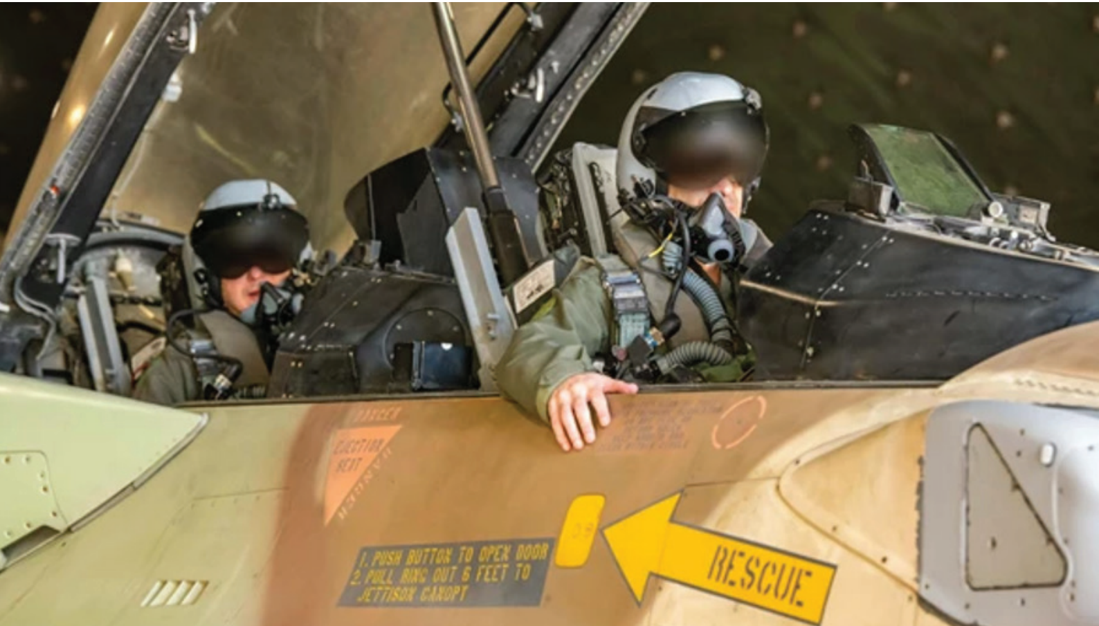
IDF pilots before their mission in Yemen.