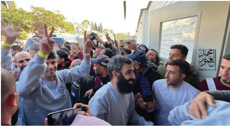
The Palestinian terrorists released in the hostage deal transferred from jail