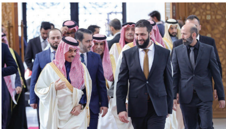
Saudi Arabia's Foreign Minister, Prince Faisal bin Farhan meeting with Ahmed Al Sharaa in Damascus