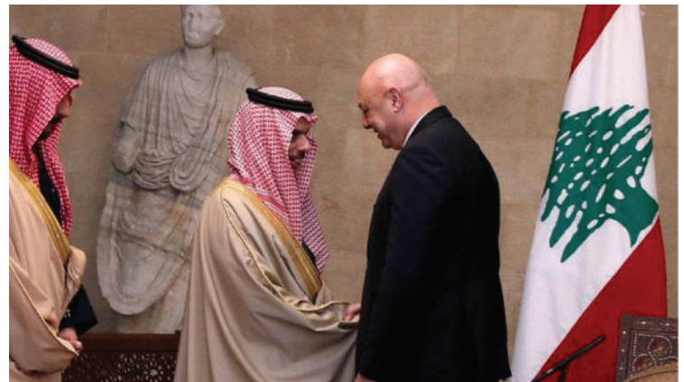
Saudi Arabia's Foreign Minister, Prince Faisal bin Farhan meeting with Lebanon's newly elected President, Joseph Aoun, at Baabda Palace in Beirut.