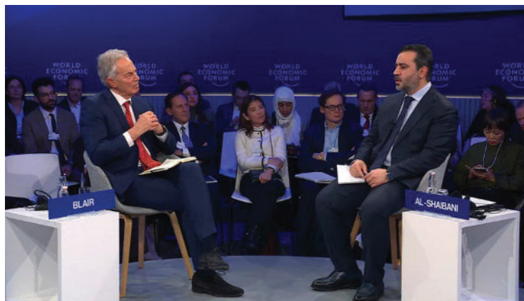
At the World Economic Forum in Davos, Switzerland, Syrian Foreign Minister Asaad Hassan al-Shibani outlined the new Syrian government's vision for the country's future.

to continue for several weeks, essentially serving as a continuation of the "Summer Camps" operation