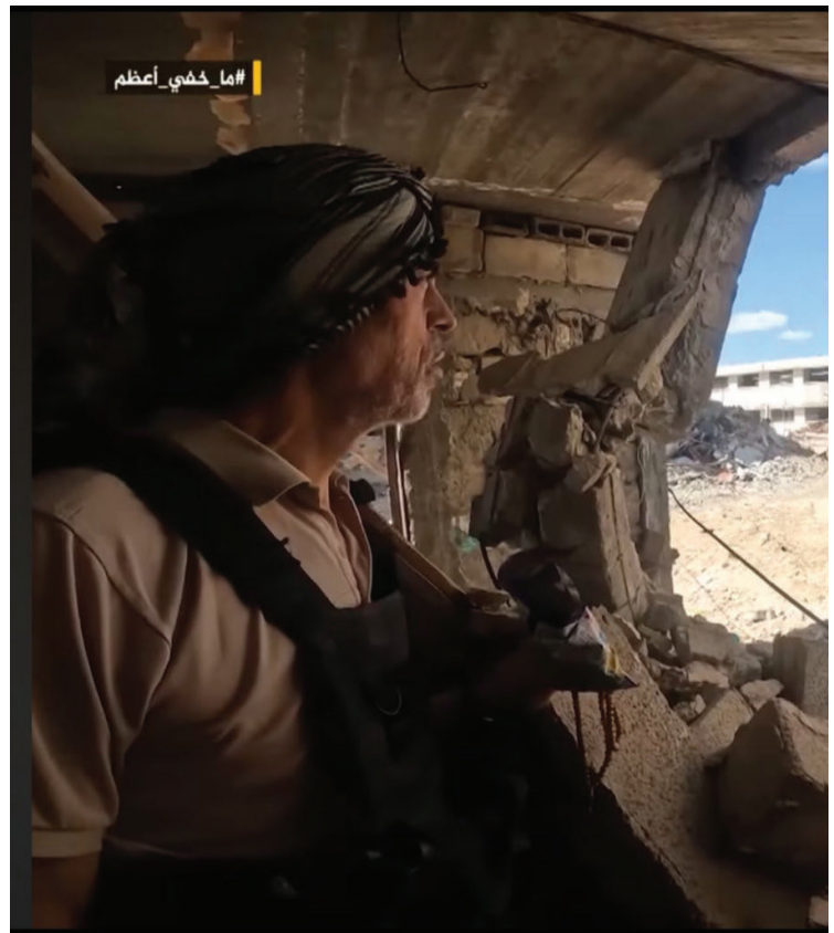
Yahya Sinwar during the war as he appeared in Al Jazeera's program