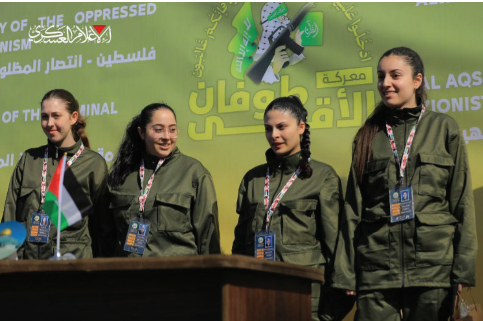
The four released female soldier hostages in Hamas's staged spectacle