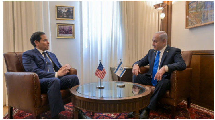
Prime Minister Netanyahu meeting with Secretary of State Marco Rubio

Israel Defense and Security Forum Transparency Register Number: 750395594910-66