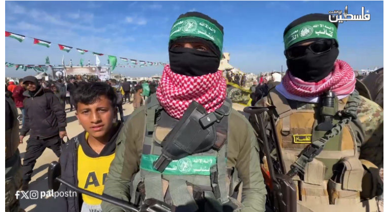
Gazan children dressed as Hamas terrorists "celebrating" their victory.

than Hamas and would treat any entity (including the PA and Arab countries) as occupiers that they would fight against. He highlighted allies of Hamas like Iran, Turkey and South Africa that provided it with material and political support. He also vowed that Hamas will rebuild and expand its military power , emphasizing that its key strength lies in its ability to attack Israel whenever it chooses.