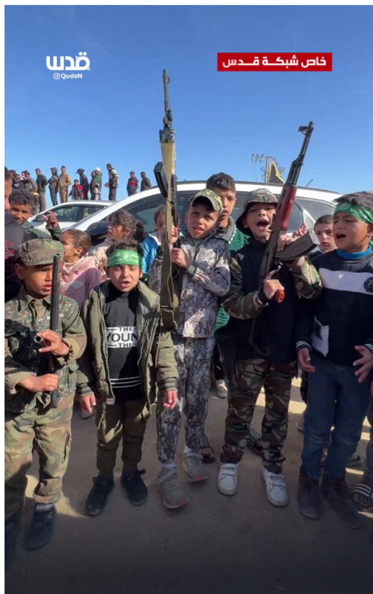
Gazan children posing with weapons as Hamas terrorists in Gaza

Due to Israel's threats, Hamas announced its commitment to the deal—provided that Israel also adheres to it. However, at this stage, it may be too late for Hamas, as it is trapped within its own rhetoric and what it called "victory displays." Israel is no longer demanding only three hostages but all nine. Hamas is in a weak position to resume fighting; having already lost nearly a quarter of the hostages it held (likely half of the living ones). If another ceasefire occurs, it will only be under conditions that include Hamas' expulsion and the deportation of Gaza's Arab population.