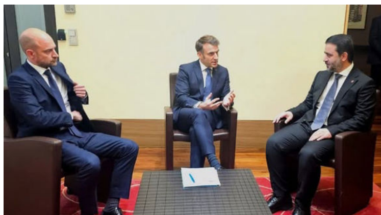
Syrian Foreign Minister Asaad al-Shibani participated in a summit in Paris, meeting with French President Emmanuel Macron and Foreign Minister Jean-Noël Barrot.