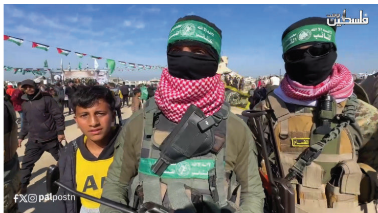
Gazan children dressed as Hamas terrorists "celebrating" their victory.

than Hamas and would treat any entity (including the PA and Arab countries) as occupiers that they would fight against. He highlighted allies of Hamas like Iran, Turkey and South Africa that provided it with material and political support. He also vowed that Hamas will rebuild and expand its military power , emphasizing that its key strength lies in its ability to attack Israel whenever it chooses.