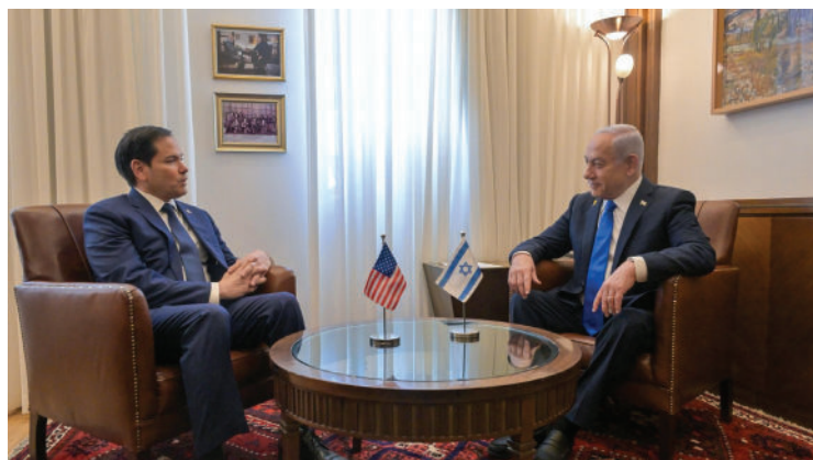
Prime Minister Netanyahu meeting with Secretary of State Marco Rubio

Israel Defense and Security Forum Transparency Register Number: 750395594910-66