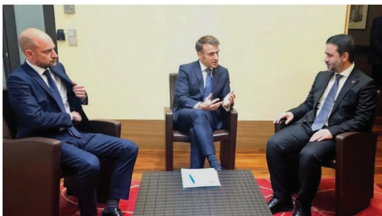
Syrian Foreign Minister Asaad al-Shibani participated in a summit in Paris, meeting with French President Emmanuel Macron and Foreign Minister Jean-Noël Barrot.