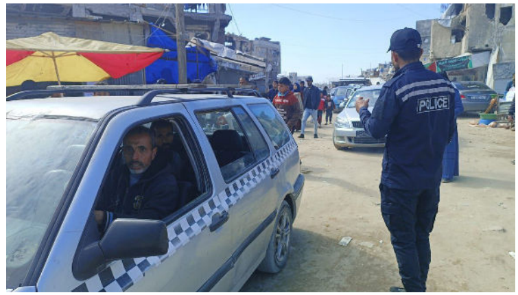
Hamas police patrolling markets to make sure vendors are not raising prices