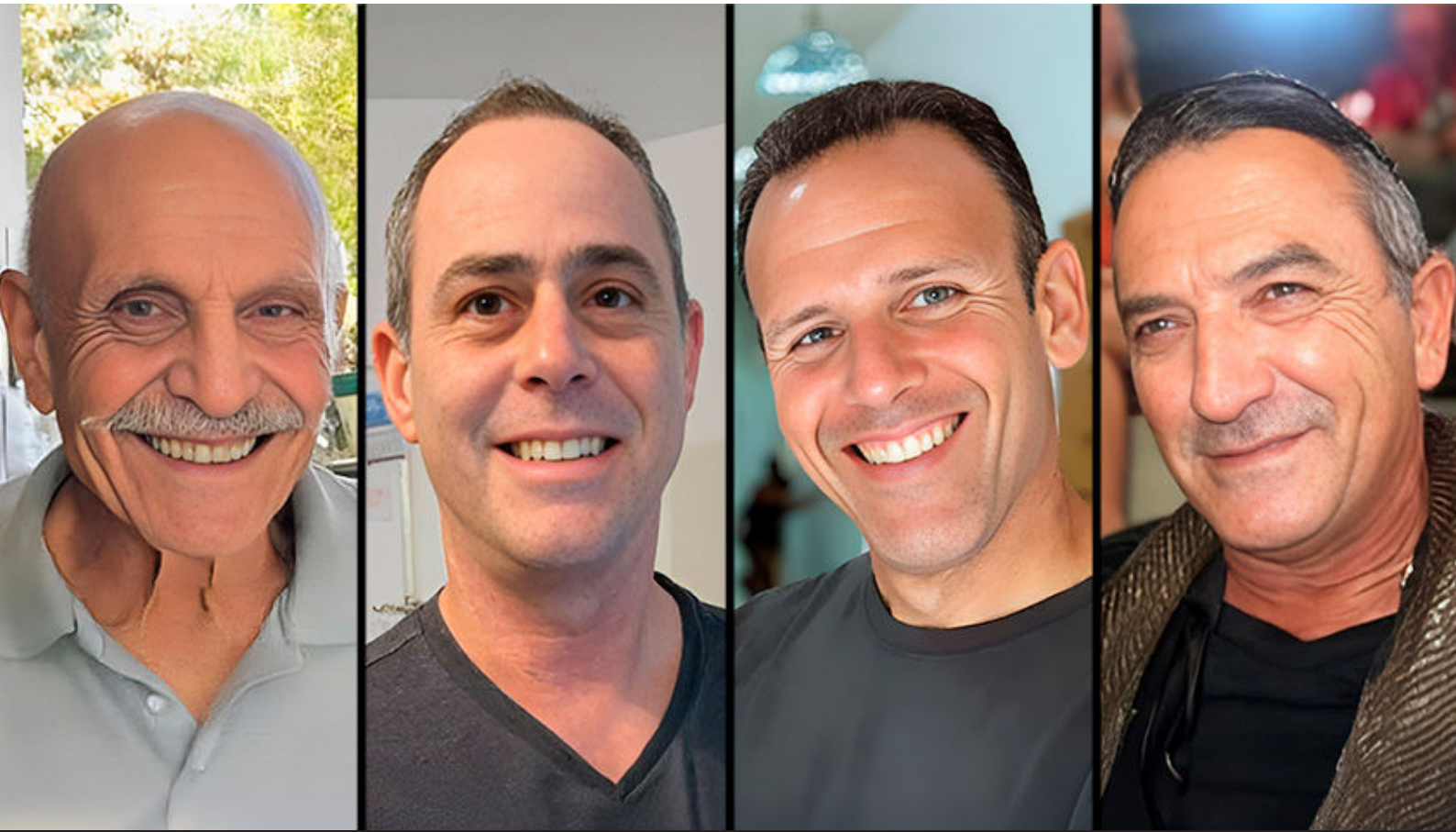
Released bodies of hostages who were murdered during Hamas captivity