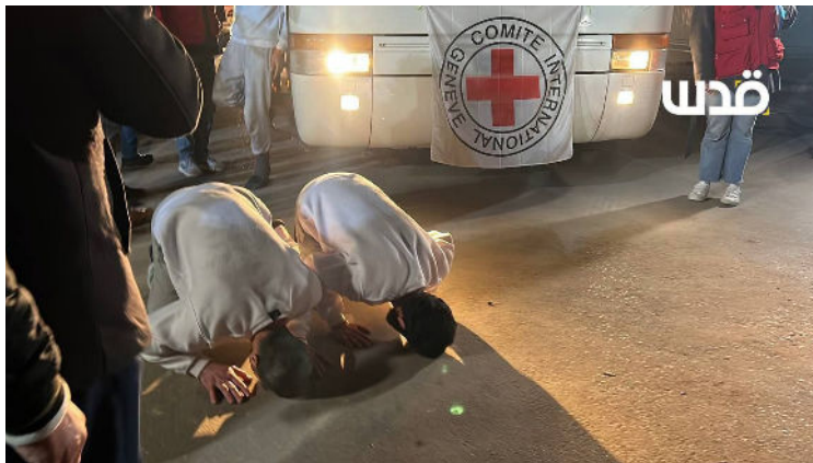
Released Palestinian terrorists who were released in the last batch of hostage releases in Phase 1