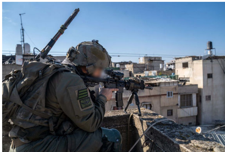
IDF soldier operating in Northern Samaria as part of the IDF's counter terrorism activities.