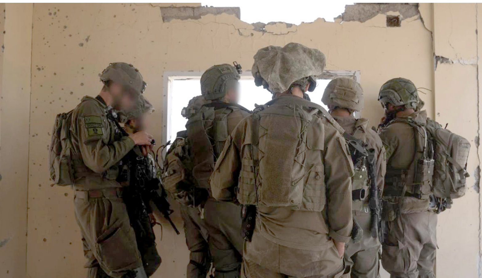
IDF troops operating in the Morag Corridor in Gaza