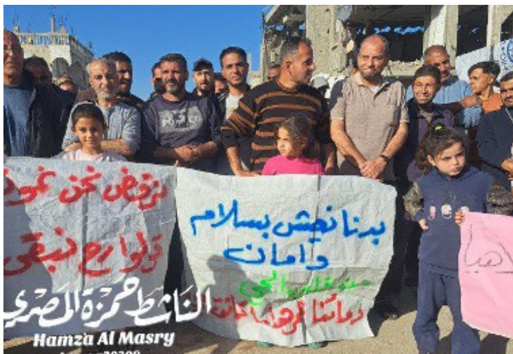
Gazans openly protesting against Hamas and the spiking prices of food