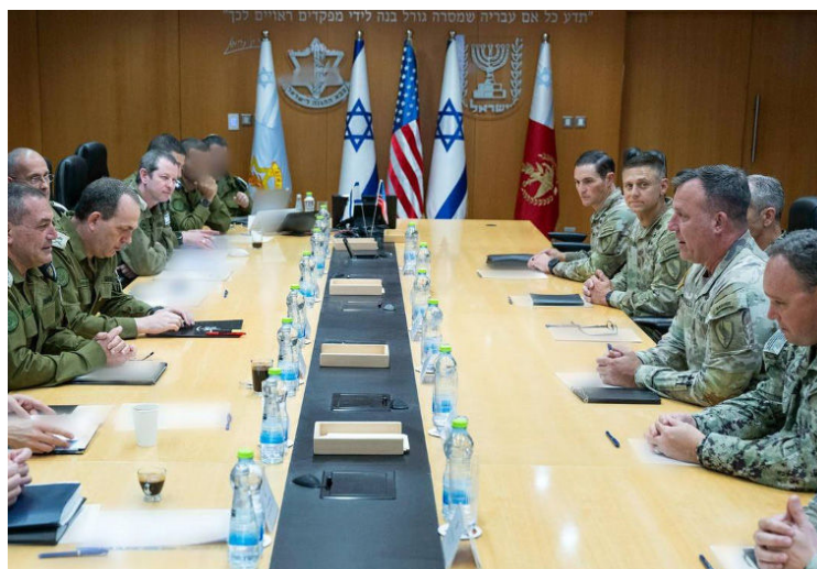
General Kurilla meeting with IDF counterparts at IDF HQ