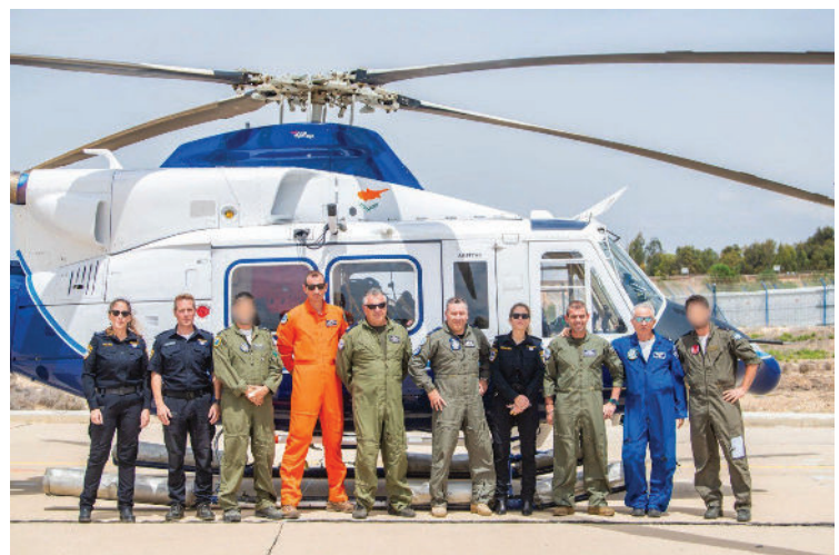
Cypriot helicopter brought to help Israel fight the fires around Jerusalem

Prime Minister Benjamin Netanyahu spoke with Sheikh Muafak Tarif , the spiritual leader of the Druze community in Israel . Tarif expressed gratitude for Netanyahu's orders to protect Syrian Druze this week. According to the Prime Minister's Office, Tarif said Israel's actions " sent a deterrent message to the Syrian regime " and reaffirmed Israel's commitment to the Druze community in Syria .