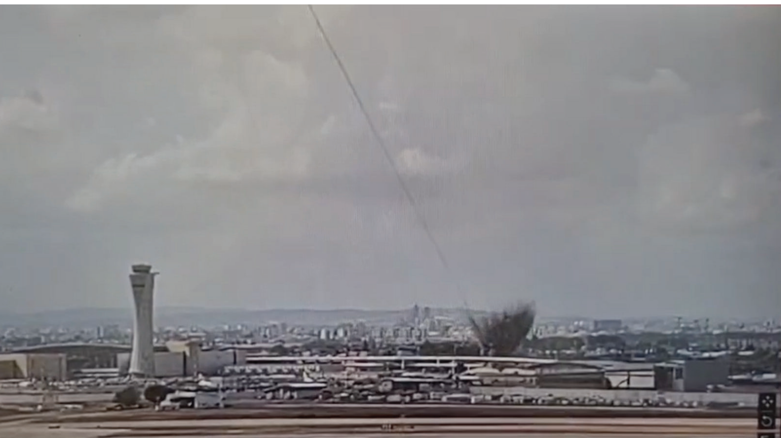
A Houthi missile hitting Ben Gurion airport on May 4th.