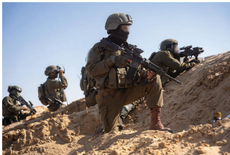
IDF troops operating in Gaza

The U.S. , Israel , and representatives of a new international foundation are close to reaching an agreement on how to resume the delivery of humanitarian aid to Palestinians in Gaza without Hamas control , according to two Israeli officials and one U.S. source.