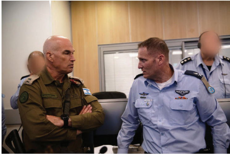
Air Force Commander, Tomer Bar, and Northern Command Commander, Uri Gordin during Israel's aerial operation in Syria