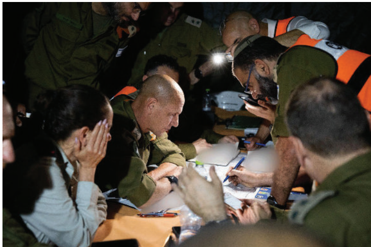
Situational assessment with representatives from Israel Homefront Command, Fire Department and the Police in the fire area

Druze representatives in the Jaramana area, a suburb of Damascus , reached an agreement with Syrian regime officials to hand over heavy weapons in their possession and to reinforce regime security forces in the area.