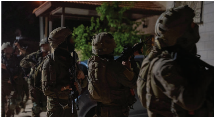
IDF troops in counter terrorism operations in Judea and Samaria