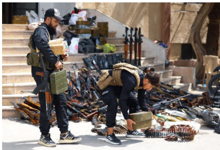
HTS forces collecting weapons and ammunition from residents and local notables in the cities of Sahnaya and Ashrafiyah Sahnaya| Source: General Command News Ahmed Al-Sharaa | Al-Julani on Telegram, https://t.me/syriaaa_2025