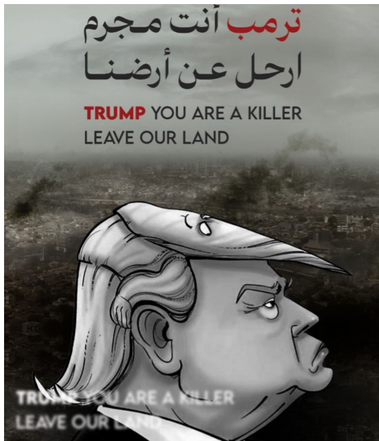
Hamas propaganda ahead of President Trump's visit to the Middle East