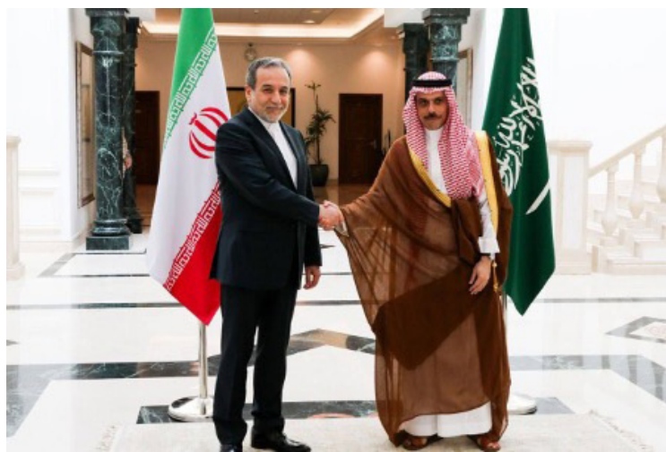
The foreign ministers of Iran and Saudi Arabia, Abbas Araghchi and Prince Faisal bin Farhan Al Saud, respectively, met in Jeddah, Saudi Arabia, on May 10, 2025

While these incidents are officially described as accidents , the pattern and proximity of events—especially at military-related sites—suggest possible covert sabotage operations , potentially involving booby traps , akin to Hezbollah's past use of explosive decoys.