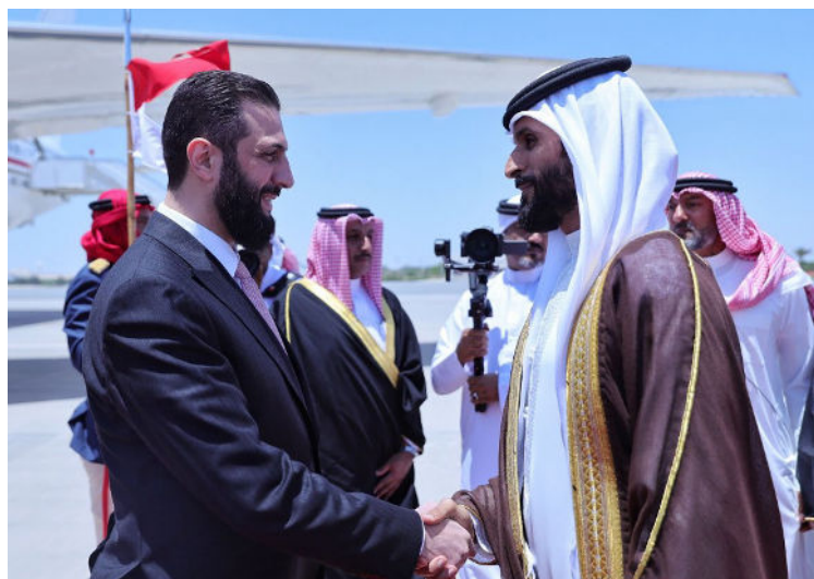
Syrian President Al-Julani on his first diplomatic trip to Bahrain