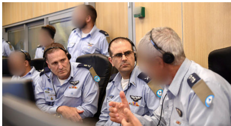
Air Force Commander Tomer Bar in the Air Force war room during the IDF attack against the Houthis