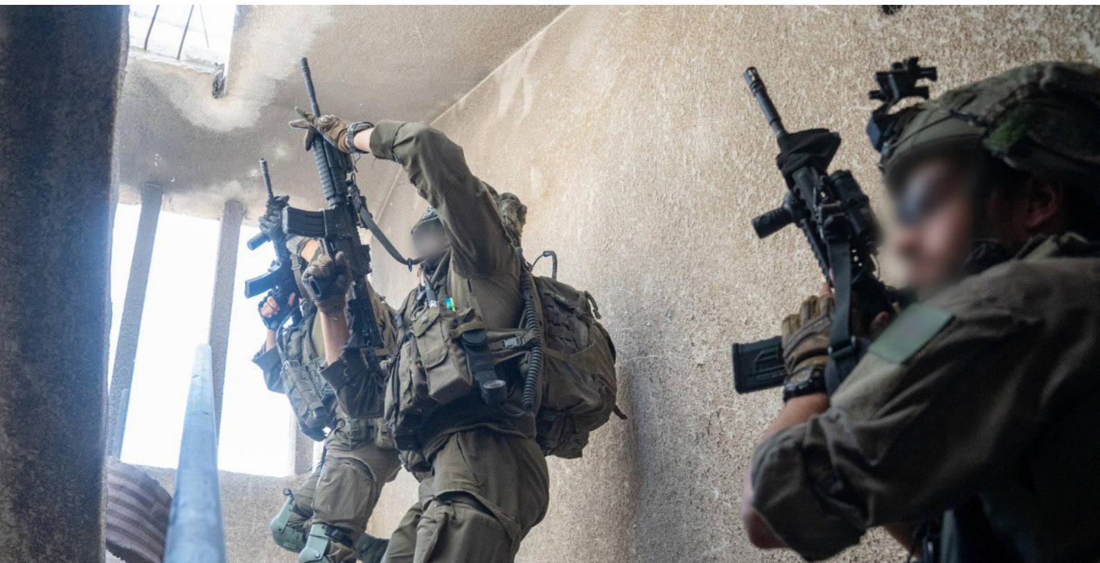
IDF troops operating in Gaza in the new operation, Gideon's Chariots.