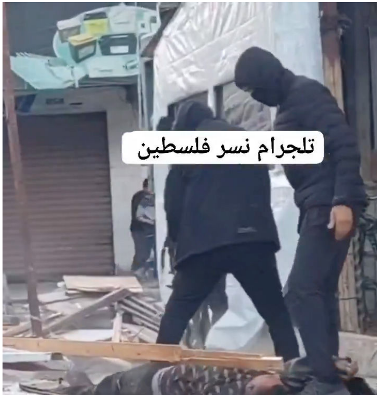
Hamas militias torturing a man stomping on his face, beating him, and shooting him under the accusation of "theft."