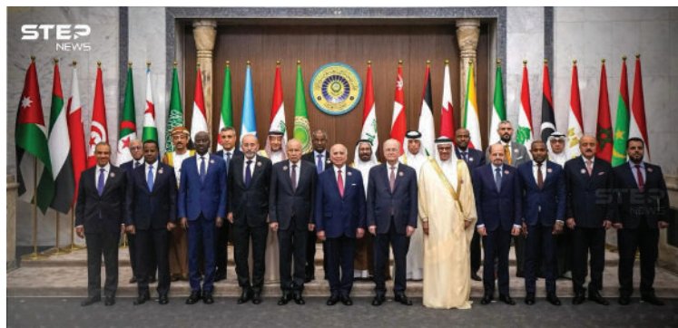
The 34th Arab League Summit convened on May 17, 2025, in Baghdad, Iraq, with leaders from 20 out of 22 member states in attendance.

Israel Defense and Security Forum Transparency Register Number: 750395594910-66