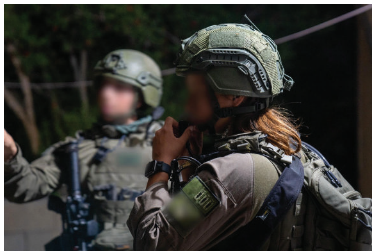
Counter terrorism operation in Samaria where 3 suspects were detained including one who laid an explosive

to the Witkoff framework , rather than a broader deal. Israeli media (Kan news) reported that the current deal on the table involves the release of 10 living hostages in exchange for a ceasefire lasting 1.5 to 2 months , alongside Israel releasing 200-250 convicted Palestinian terrorists from Israeli prisons .