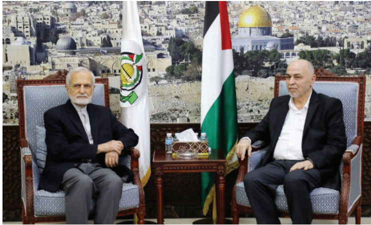
Mohammad Darwish, Head of Hamas' Leadership Council, met with Kamal Kharrazi, Head of Iran's Strategic Council on Foreign Relations, in Doha, Qatar.