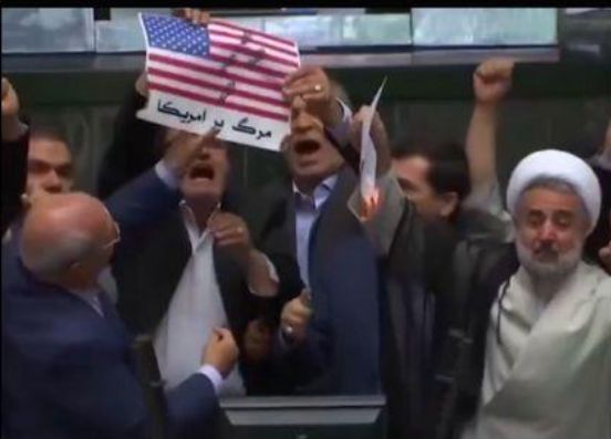
Iranian Parliament Burning American Flag