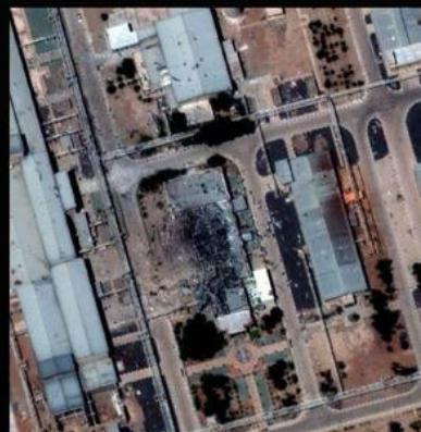
Attacks in Iran