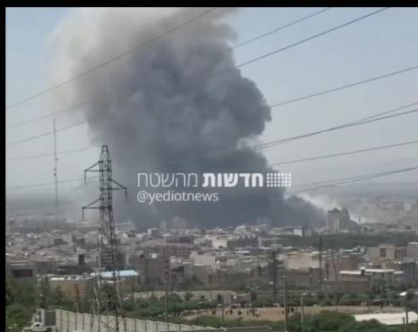
IAF attack in Tehran