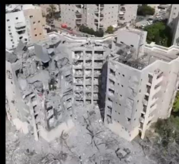
Hit in Be'er Sheva