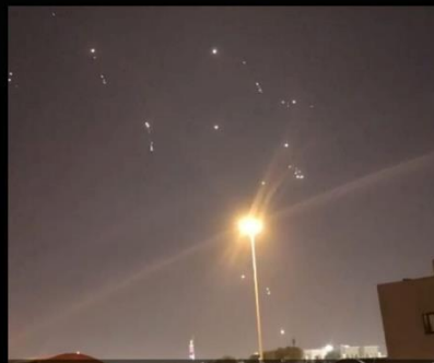
Interceptions in Qatar