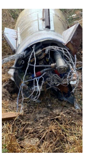
Debris from Iranian missiles in Nablus, Salfit and Tulkarem