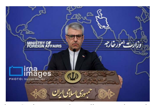
Iranian Foreign Ministry Spokesperson demanding a condemnation against Israel after reacting to the G7 statement