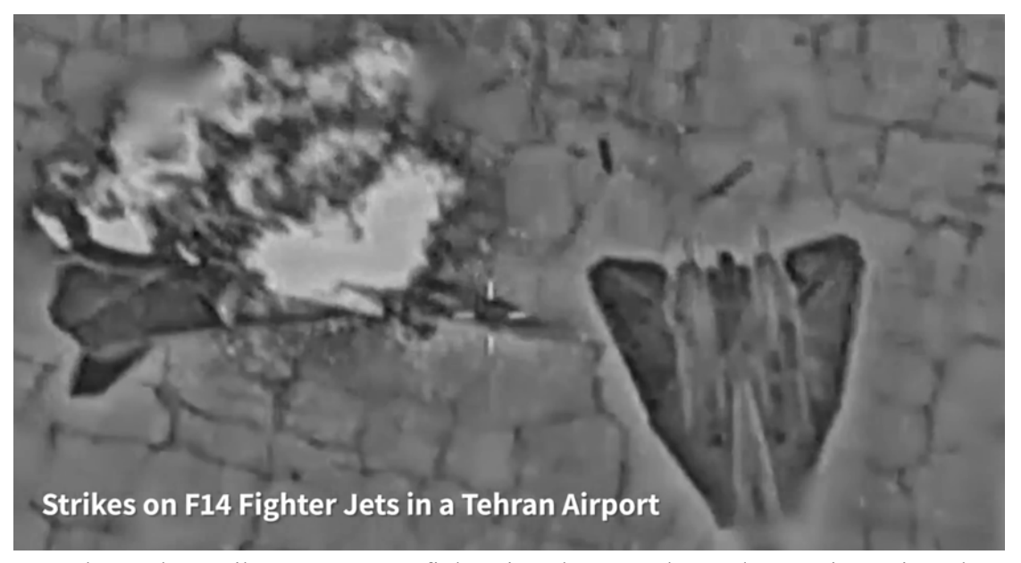
June 16th attacks: Strike on two F-14 fighter jets that were located at an airport in Tehran.