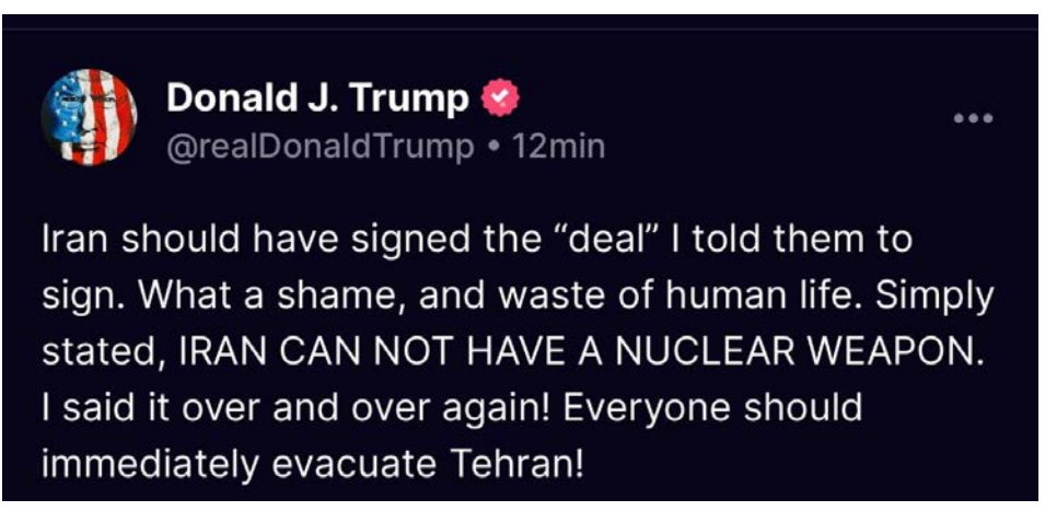
Trump's Truth Social Post