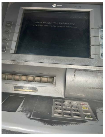
ATM of a Bank serving Iranian Security forces have stopped working