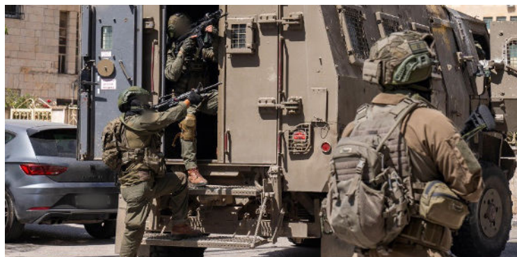
IDF troops operating in Judea and Samaria in a counter terrorism operation.