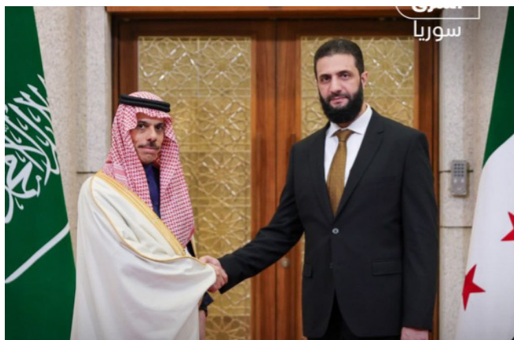
Saudi Foreign Minister Prince Faisal bin Farhan Al Saud arrived in Damascus with a senior economic delegation from the Saudi Ministry of Finance and Foreign Ministry's economic and development departments to meet Syrian President Al-Julani and Foreign Minister Faysal al-Shibani to discuss ways to collaborate on supporting Syria's economic recovery and strengthening the development of Syrian governmental institutions.