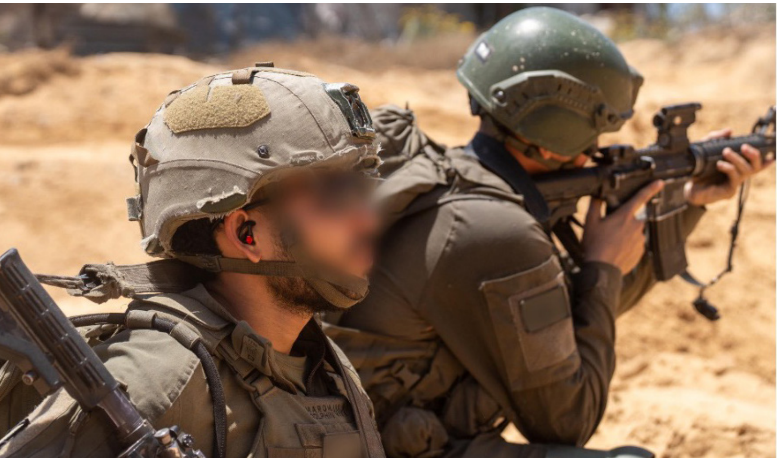
IDF troops operating in Gaza in the "Gideon's Chariots" Operations