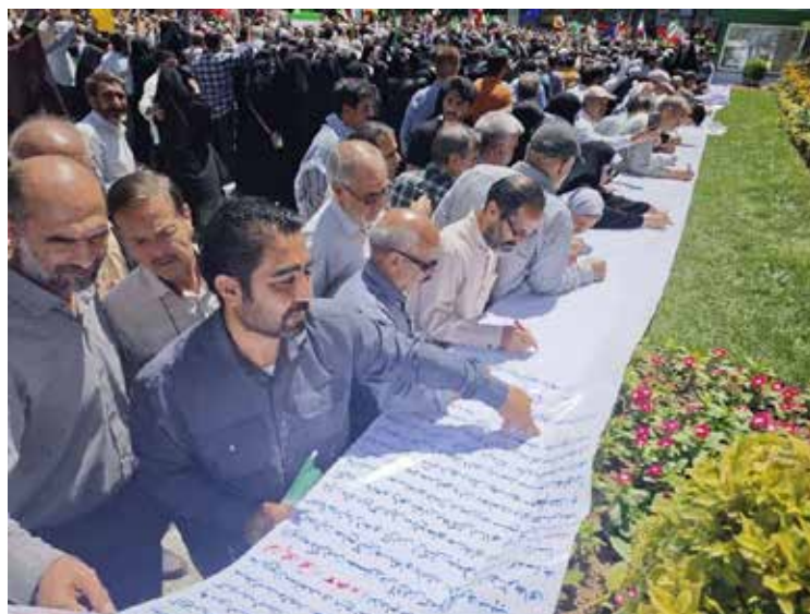
Iranian regime supporters signing a petition calling Iran to withdraw from the NPT

militia accused Hamas of turning medical facilities—especially the Nasr Hospital—into military posts and weapons storage sites, using ambulances and health buildings for combat and detention.