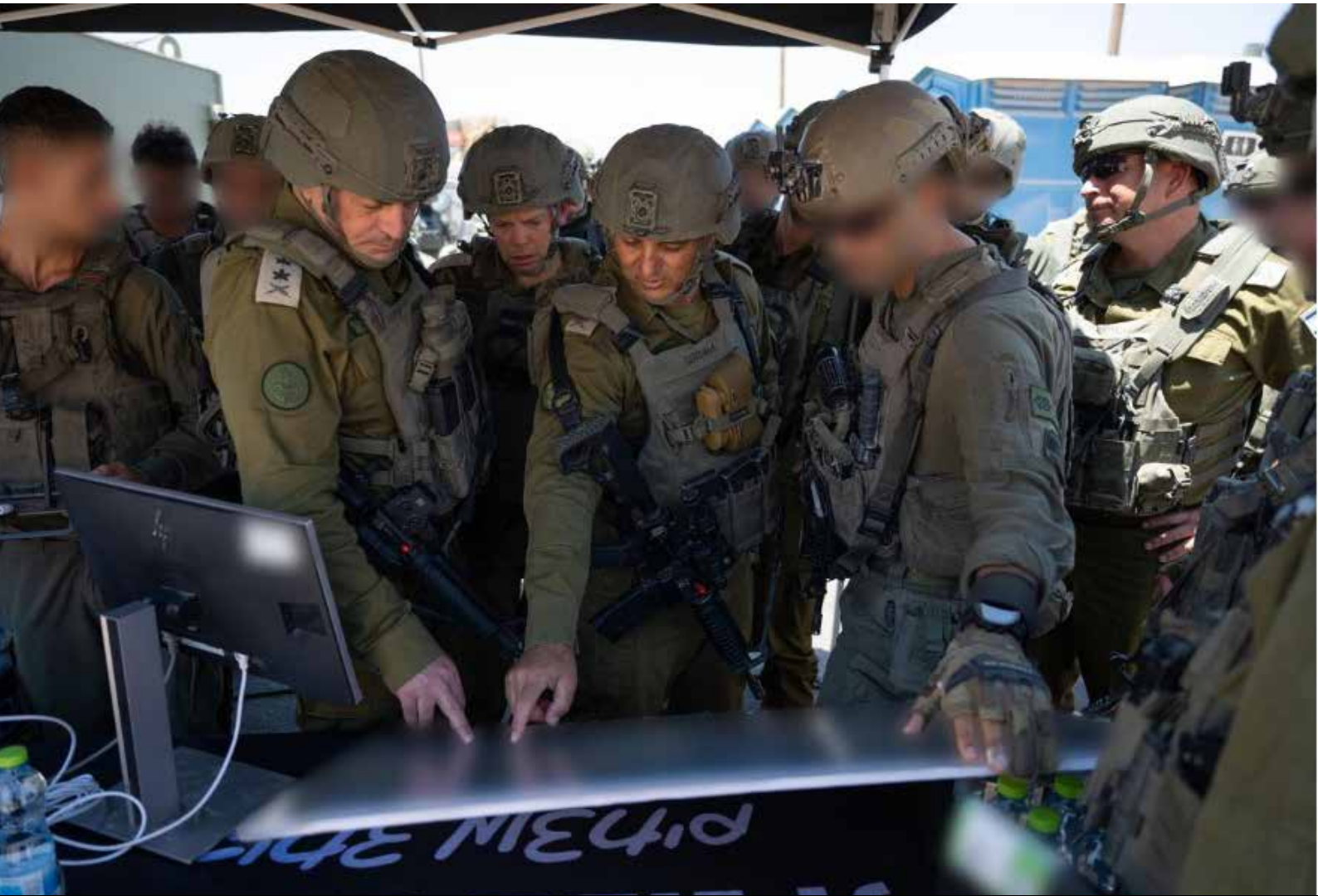
IDF Chief of Staff Eyal Zamir in Gaza announcing the IDF would continue its operations in Gaza as part of "Gideon's Chariots"