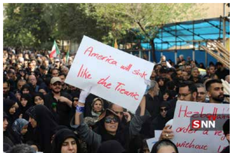
Massive public funeral in Tehran for senior IRGC commanders and nuclear scientists killed in "Rising Lion".