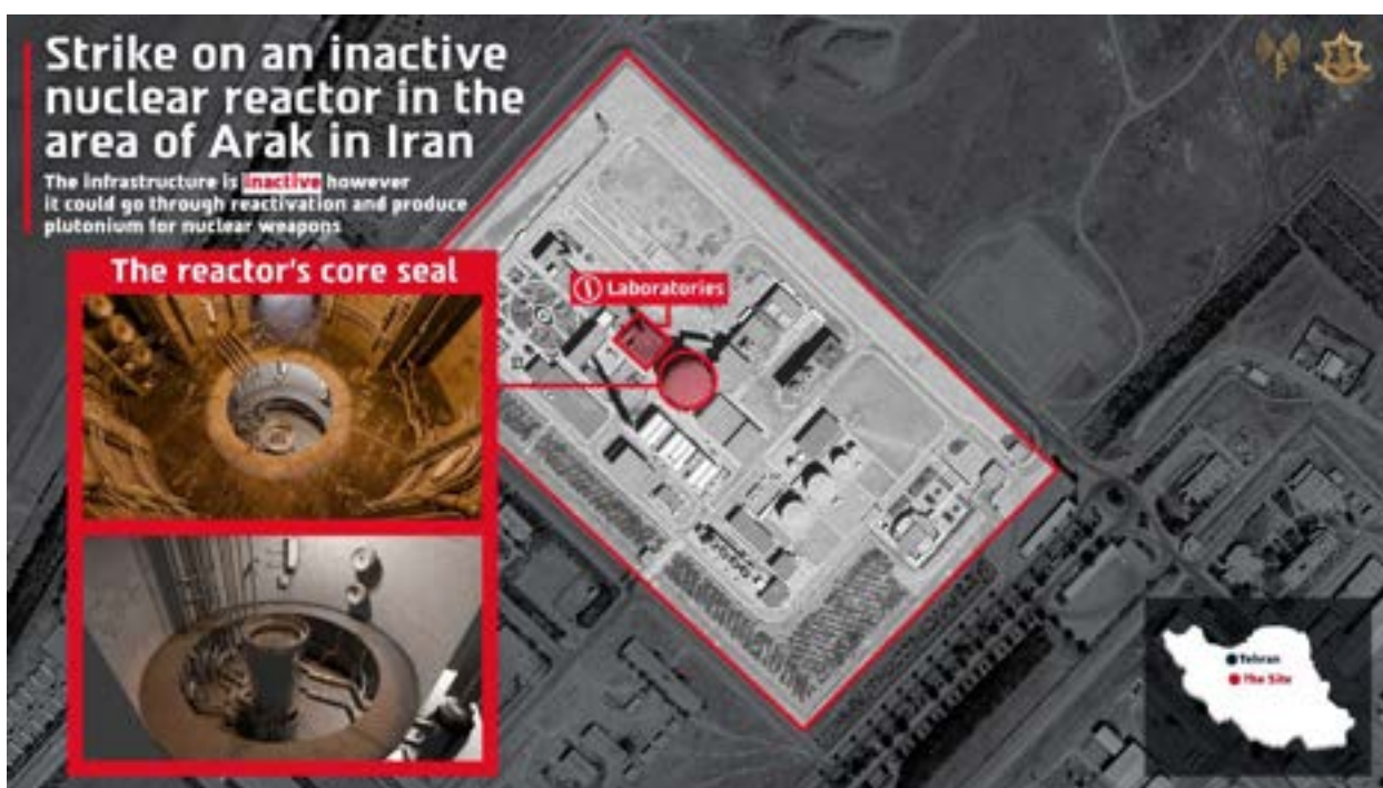
IDF's strike on an inactive nuclear reactor in Arak—a key component in plutonium production.