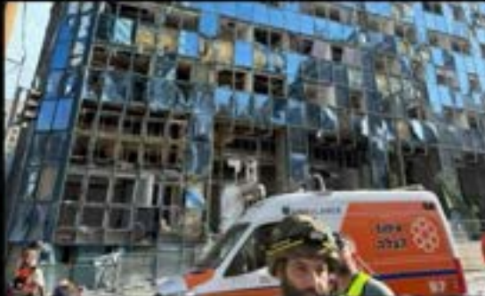
Israeli Hospital Hit by Missile