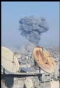
Attacks in Iran