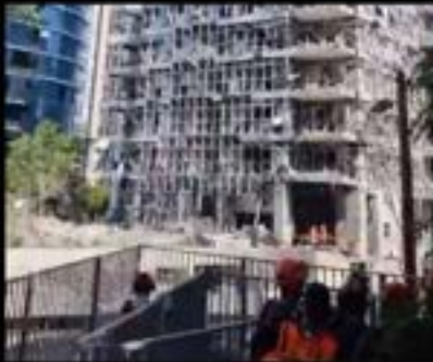
Israeli Building Hit by Missile