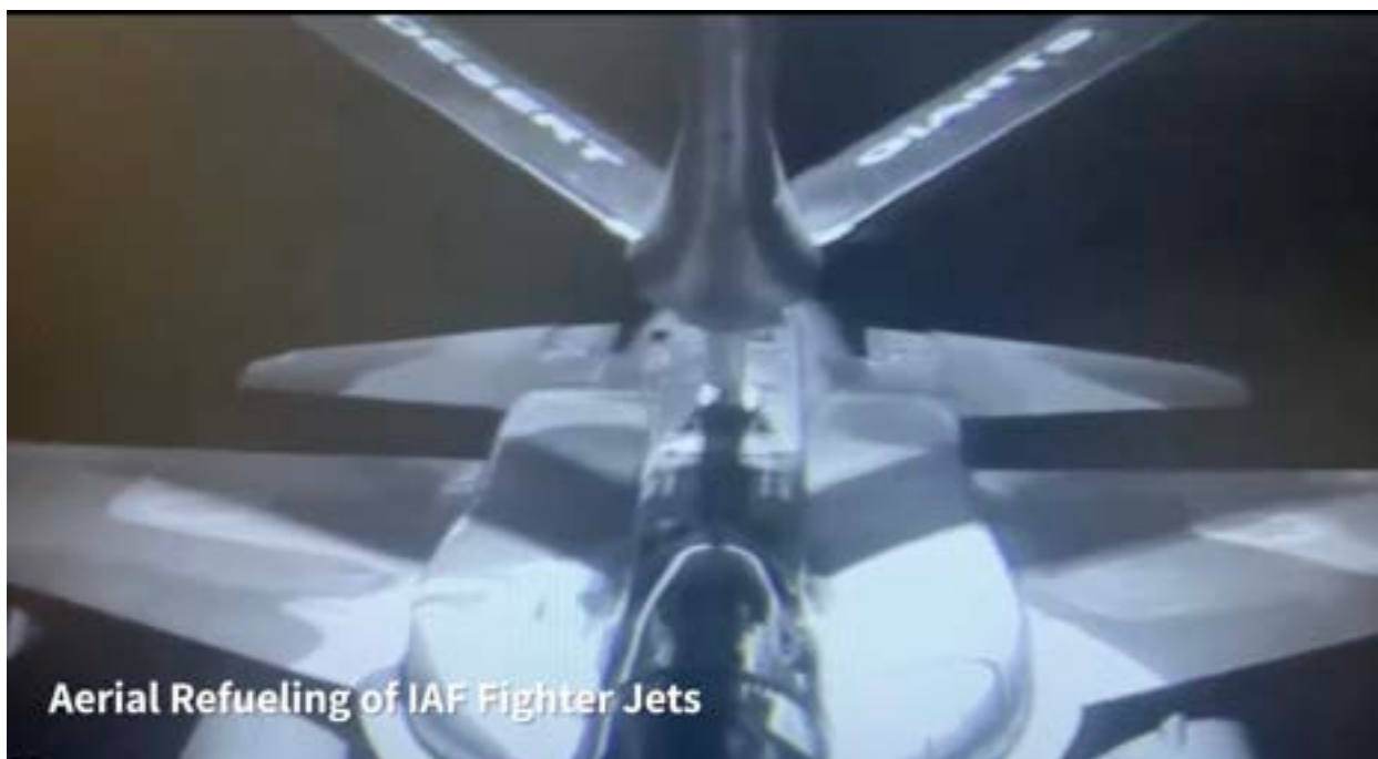
The IAF jet aerial refueling. Over 600 mid-air refueling have taken place since the start of the operation.