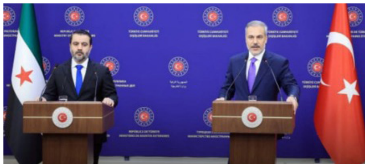
Syrian FM al-Shaibani, in a joint press conference with Turkish FM Hakan Fidan, condemned Israel