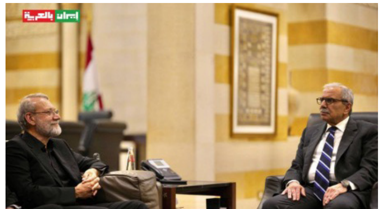
Iranian official Ali Larijani visited Beirut, meeting President Michel Aoun, Prime Minister Salam