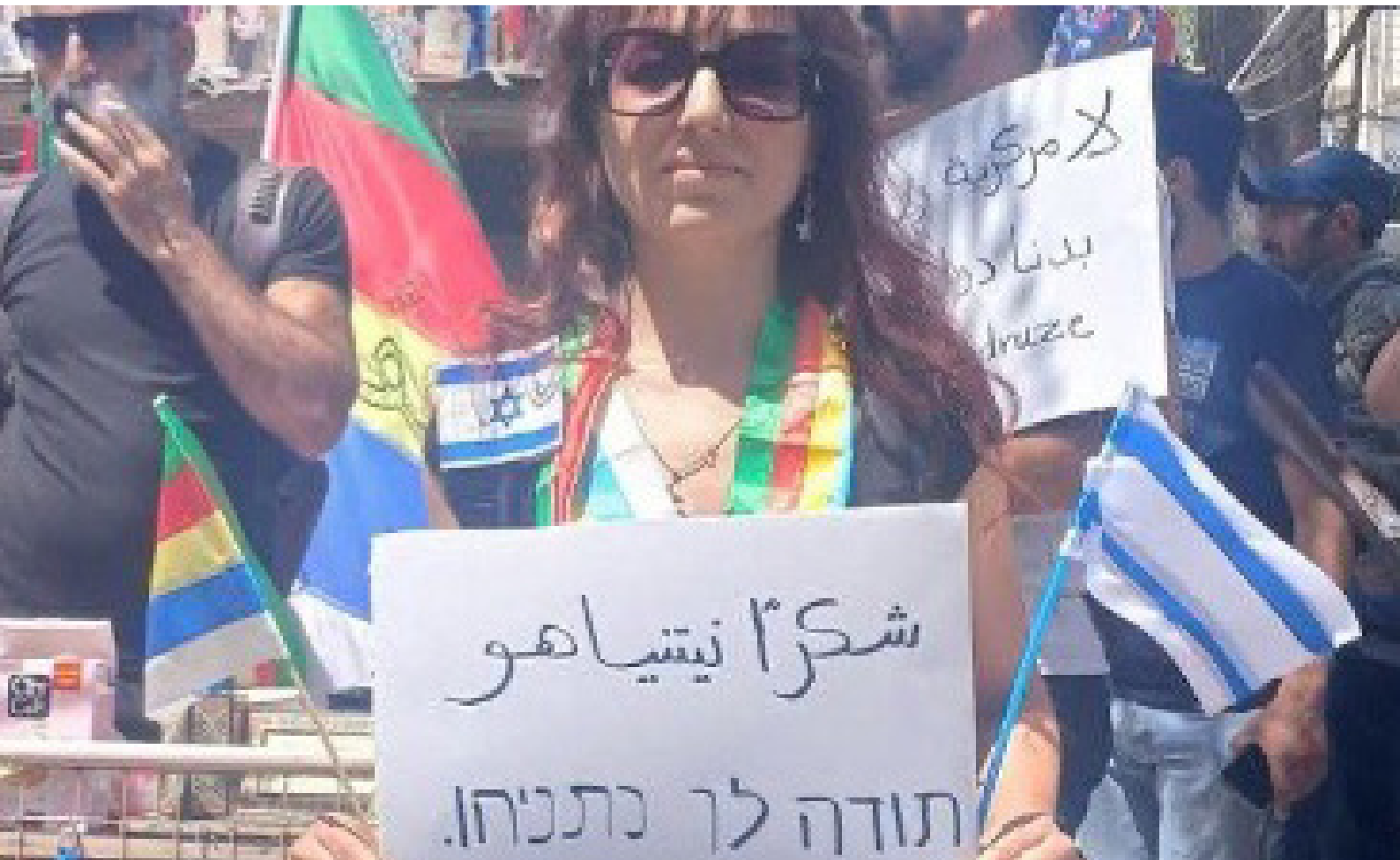
Syrian Druze in Suwayda with signs in Hebrew pleading Israel to protect them