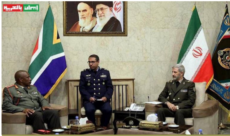
Iranian Chief of Staff Abd al-Rahim Mousavi meetint with South Africa's defense chief, Rudzani Maphwanya.

| Source: irna news agency on telegram, https://t.me/Irna_en