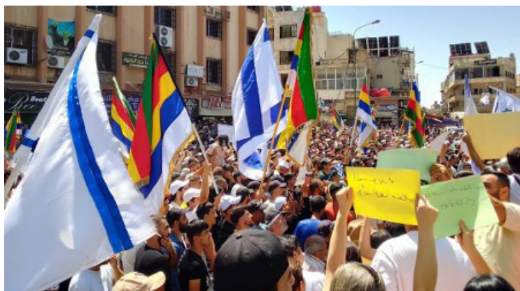
Large-scale Druze demonstrations took place, led by Sheikh Hikmat al-Hijri