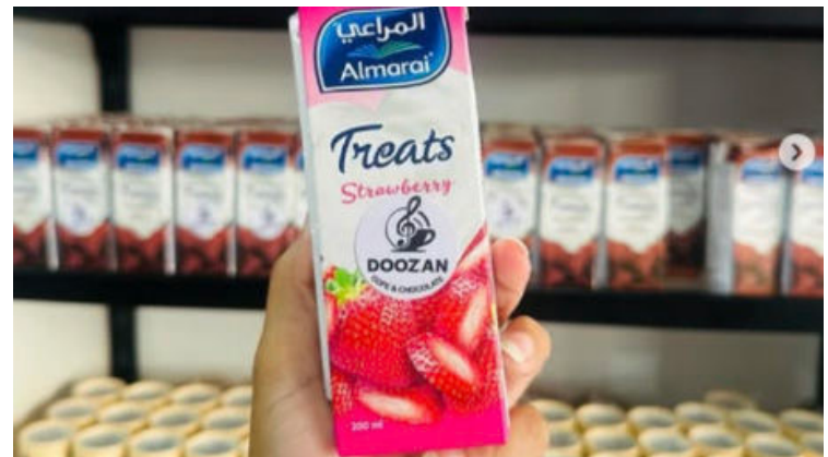
Café shop in Nuseirat where the shelves are filled with food

• Hamas has opposed the GHF distribution system , has targeted one distribution site, firing a rocket toward a truck convoy near one of the aid points .