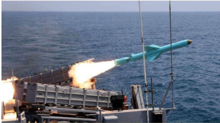
The Iranian Navy concluding a naval exercise in the northern Indian Ocean called "Enduring Force 1404".

• Iranian authorities announced the foiling of Ansar al-Furqan plots in Sistan- Balochistan , dismantling a Sunni Baloch militant cell that had planned large-scale bombings against military, judicial, and religious sites. This highlights Iran's vulnerability to internal insurgent threats even as it confronts external pressure.