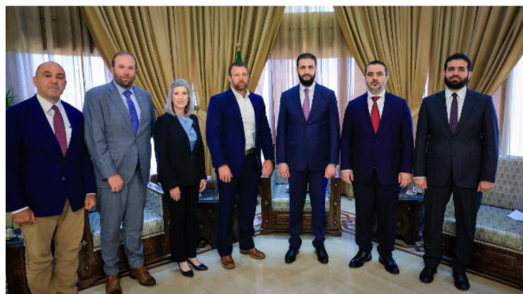
Syrian President Ahmed al-Sharaa meetin with a delegation of U.S. congressmen

weapons and munitions items and arrested suspects involved in weapons smuggling from Syria into Lebanon .