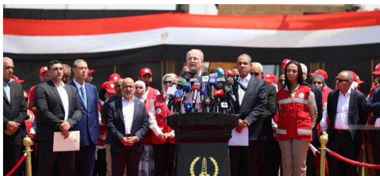
Palestinian Authority Prime Minister Muhammad Mustafa in a joint press conference with Egyptian Foreign Minister Badr Abdel-Ati at the Rafah Crossing