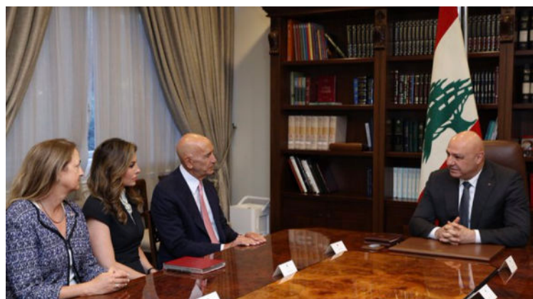
U.S. envoy Thomas Barak meeting with Lebanese President Joseph Aoun.

weapons and munitions items and arrested suspects involved in weapons smuggling from Syria into Lebanon .